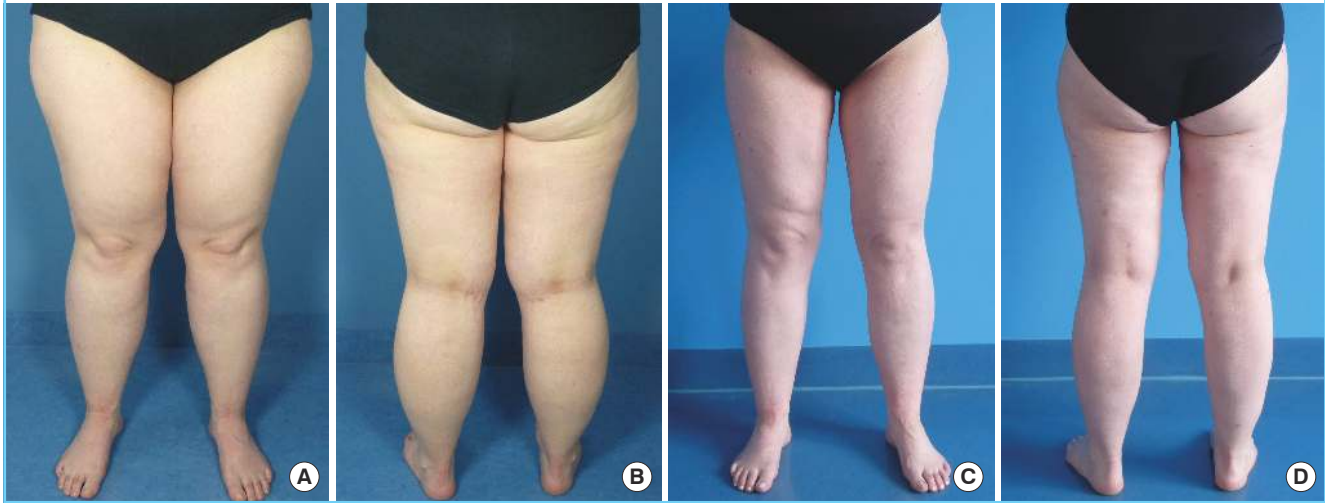
Fig. 4. Case example 2

A 24-year-old patient with stage II lipedema preoperatively (A) and 10 months after 2 liposuctions (B). A total of 8,800 mL of fatty tissue was removed from her legs.