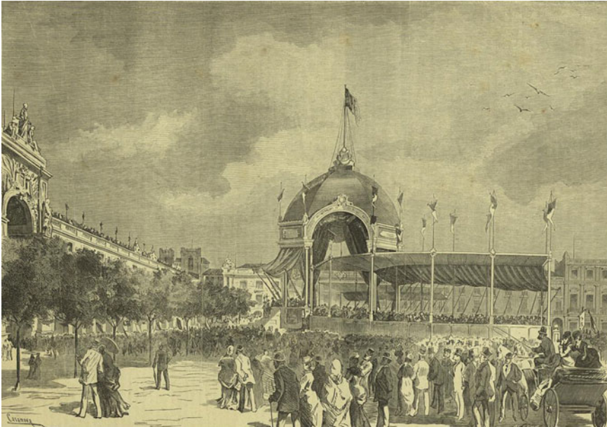
Figure 1: (Colour online) Celebrations of the tercentennial of Luís de Camões (c. 1524–80). The pavilion set up at the Commerce Square, 1 Jul. 1880, in Hemeroteca Digital, O Ocidente: Revista Ilustrada de Portugal e do Estrangeiro , 61, 1 Jul. 1880.

world among European powers, while fostering national ‘self-esteem’ and enthusiasm for the imperial cause. 21 Following the model of the civic celebrations of the French Revolution, these commemorations were largely the result of the initiative of republican men whose intention was to highlight the contrast between the decadence of the present and the glories of the past and who urged a new era – that of the Republic – and a break with the past of national decadence, symbolized by the monarchy.