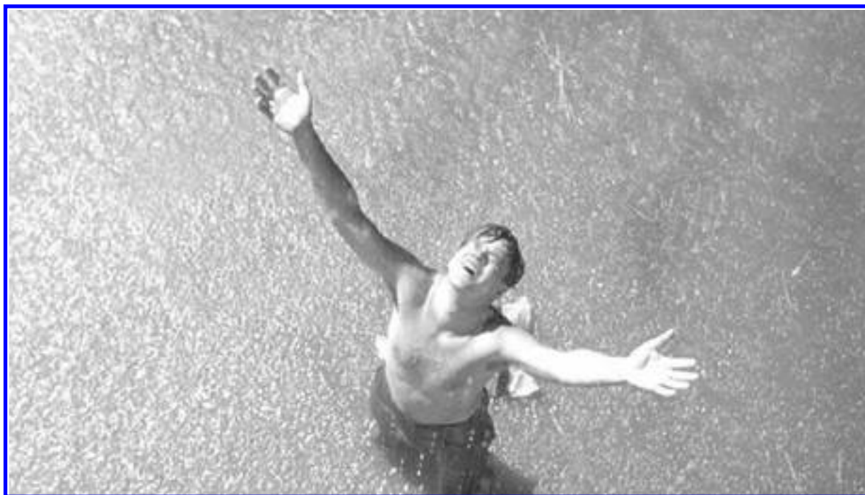
Plate 6: The Shawshank Redemption : The moment of freedom—Andy looks up with eyes shut.

There is one other parallel between the opera scene and the escape scene that illuminates the cinematic mechanism at work here to articulate our inner song. Both scenes employ aerial shots. In the opera scene, the camera peers down over the prison yard as the music envelopes the inmates; in the escape scene, at the moment of freedom, the camera looks down directly from above Andy as he looks up into the night sky with his eyes tightly shut as if in prayer (plate 6). In the first scene what we see “from above” is aural; we hear with eyes positioned from the perspective of the loudspeakers that tower over the prison yard. In the second scene, what we see is divine in that the camera seems to hover above Andy like Žižek’s Holy Ghost. Presumably we are viewing Andy from the absolute perspective of freedom since the camera is positioned outside any available reality. Here is the ideal gaze of a freedom that can grasp the sum total of Andy’s humanity in