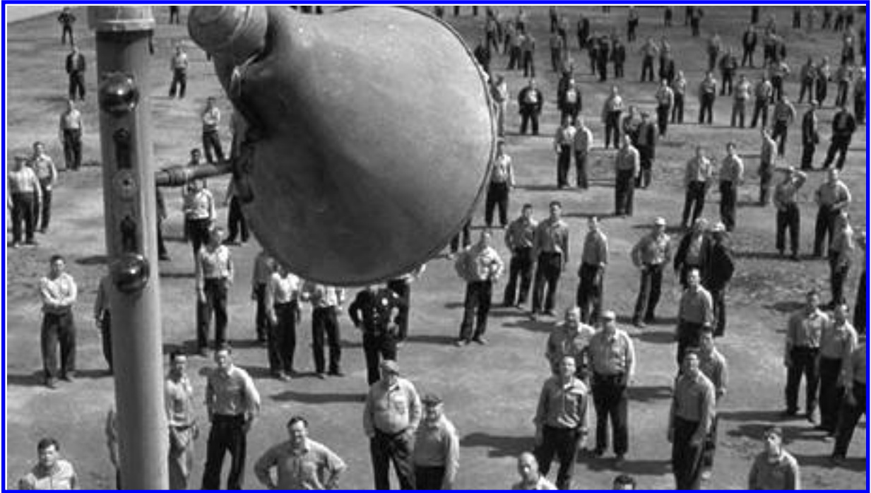
Plate 4: The Shawshank Redemption : Prisoners standing motionless before the sound of Mozart.

ject into another dimension." This other dimension is the space of the Romantic song, for what the prisoners perceive as "absolute music" is also philosophically absolute. The music, states Žižek, is the "brief apparition of a future utopian Otherness," an absolute he equates with none other than the "Holy Ghost." 28 Mozart's aria signals a Pentecostal promise of an ancient sound—a "Futures past." 29