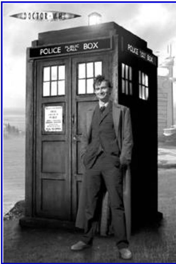
Plate 2: Dr. Who's TARDIS (not actual size).

much in a virtual song? Why locate the meaning of the subject in the contortions of a nonconceptual music that is eternal and momentary, infinite and enclosed? Because such contortions echo the contradictions inherent within the subject. What the Romantic song represents is the modern condition itself, and it does so by inverting the ancient harmonic order. Whereas in antiquity the music of the spheres established a global harmony that guaranteed our unity with the world, in modernity the song is a global dissonance that requires future resolution. Or as Arthur Schopenhauer put it, music is the image of the "delays, postponements, hindrances, and afflictions" that torment us since "we ourselves are now the vibrating string that is stretched and plucked." 18