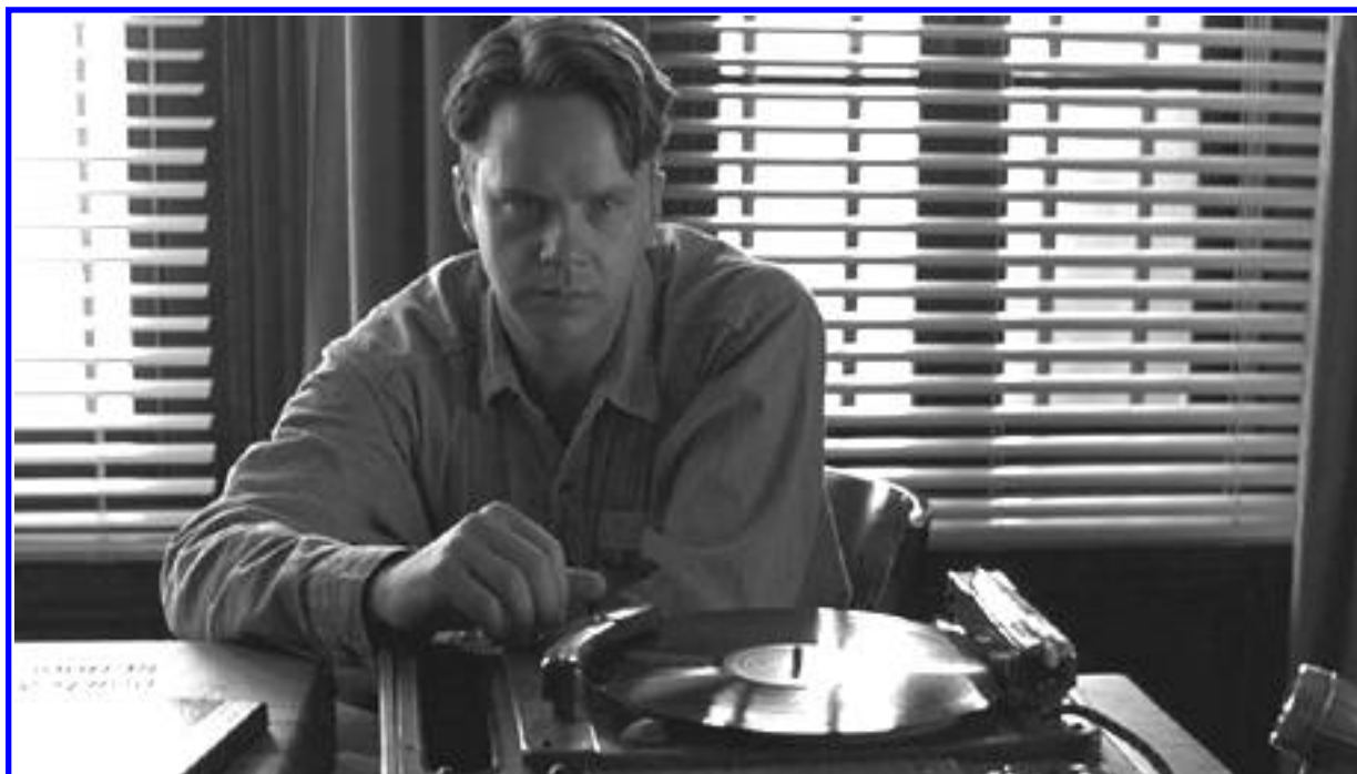
Plate 3: The Shawshank Redemption : Andy locked in the warden's office, transmitting Mozart.

"briefest of moments" in which "every last man at Shawshank felt free" is one in which the inmates are held captive by the music of their true being. They stand in the prison yard entirely static, as a tableau of what the music is doing within them (see plate 4). They hear their song, and the suspension of motion that coincides with their hearing forms a visual representation of an internal suspension of time in which they experience the originary point of freedom. Like the prisoners briefly let out of their cells "in freier Luft" (into the fresh, literally the free, air) in Fidelio (act 1, sc. 9), the prisoners in the yard at Shawshank are stunned into a hushed moment of musical stillness by the thought of freedom. For that moment, the prisoners find themselves in the strange space-time dimension of the Romantic song.