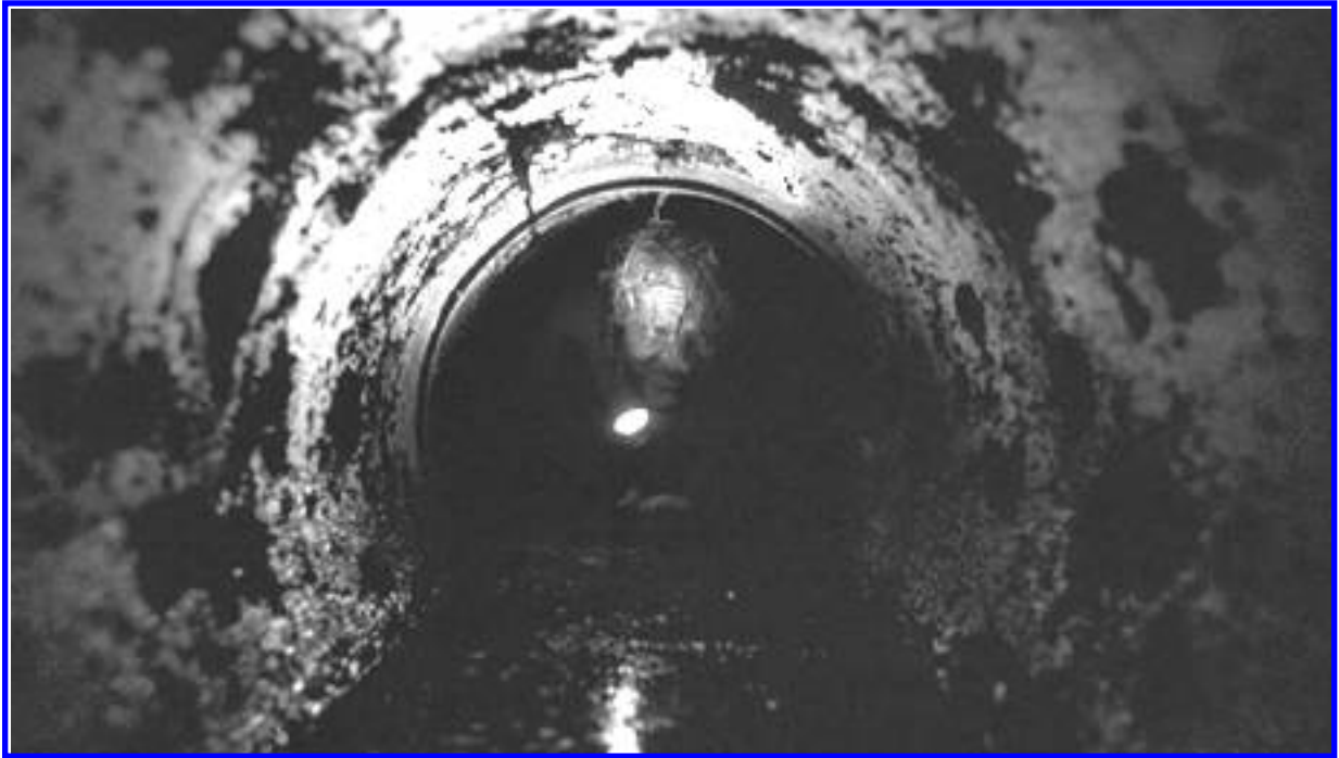
Plate 5: The Shawshank Redemption : Andy's escape through a sewage pipe.

dies" whose voices we hear wafting out of the loudspeakers are, like Leonore, analogous to the cover girls we see in Andy's cell who literally cover the tunnel through which he gains his freedom. They are all forms of Lady Liberty, beckoning the individual into the land of the free. So in the film, the metaphysics of hope and the actuality of freedom are presented as one and the same, except that hope is beautiful but devoid of real content, whereas freedom is pure content but covered in shit. Freedom is real and ideal—shit and Mozart. 33