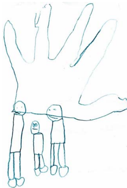
Figure 2. Artwork, My Support People, boy aged 6

When gathering feedback from the younger children, one researcher used a "Cheezel scale" to help children talk about their experience. She placed five Cheezels (ring-shaped cheese snacks) on her fingers and asked the children to score each section of the interview out of 5 in relation to its child-friendliness, the extent to which it was fun, and whether the researcher listened and understood their answers. Although the children could eat the snacks if they removed them from her fingers, they generally ranked the sections highly before explaining their decision. They reported that this was a fun way of giving feedback. From this advice, tools were then modified before being used with other children.