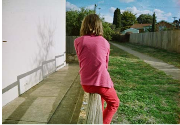
Figure 5. Artwork, Me, girl aged 9

Although we have much to learn about how best to engage children in research, this project greatly benefited from the opportunity to work with children themselves in constructing and delivering its research activities.