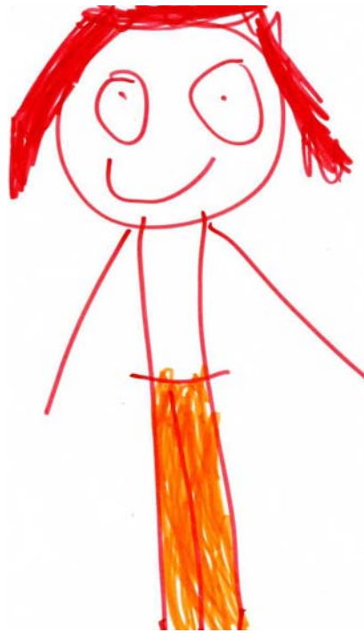
Figure 1. Artwork by a girl aged 7

Eighteen children aged between 6 and 14 years and 7 young people aged between 15 and 21 years participated in the study. Of these, 8 identified as being Aboriginal or Torres Strait Islander; 14 were male and 11 were female. All participants had accompanied their parent during a period of homelessness in the past.