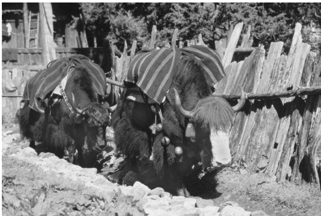
FIGURE 3 Yaks transporting potatoes to the winter settlement at Phale.

(non-user-group members) have to pay fees. A healthy population of blue sheep above Khānpāchen (Brown 1994) indicates that the local management of pastures is not only sustainable, but also supports wildlife. Since the refugee residents of Phale do not have pastures or pasture rights, they have a system of coherding with the residents of Ghunsā. In exchange for half the production ( ghiu, churpi ), Ghunsā herders take Phale livestock to their summer pastures. The livestock is kept near Phale in winter. Another group using Ghunsā's pastures are Chetri shepherds from the Tapplejuñ area, who practice extended transhumant migration.