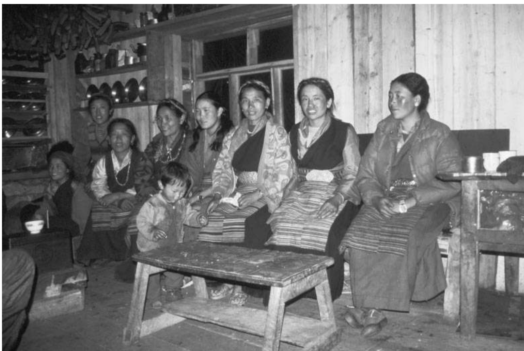
FIGURE 4 A group of women in Ghunsā preparing for a meeting. (Photo by U. Müller-Böker, September 1998)

against the project, had already led to rumors about stationing of troops, prohibition of forest resource use, and grazing restrictions. The KCAP team had to learn the following lesson: “As a result of misinformation, it was very difficult for the extension team to build trust with the local communities and address conservation issues” (KCAP 1998: 12).