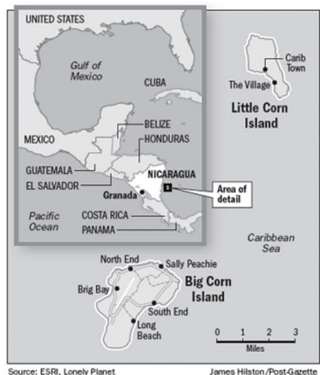
FIGURE 1. Map to the Corn Islands.

The sampled lizard fauna of the Corn Islands consists of 14 species belonging to nine families (Table 1), one of which, Gekkonidae, includes two introduced species in the islands. We recorded three species (one third of the lizard species we collected) that were previously undocumented