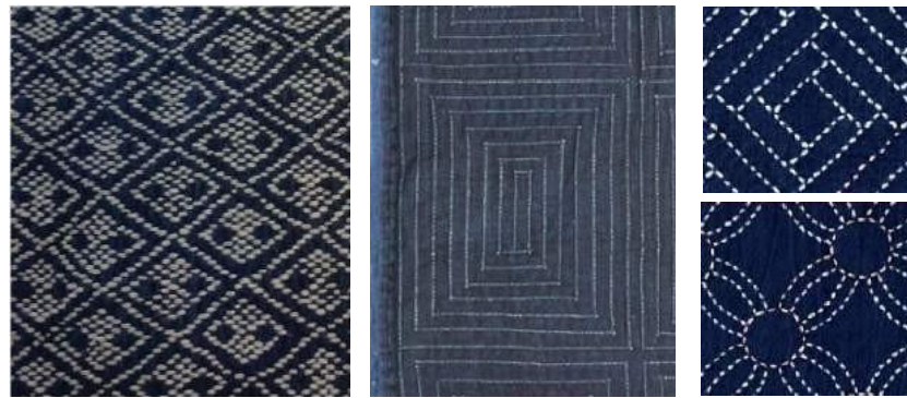
Figure 1. Some examples of patterns with the sashiko technique

This technique produces a straight or curved geometrical design sewn with a repeated pattern, giving the fabric a more interesting look. It is also widely used in various fashion design products with a range of fabric and thread colors used. It is evident in the proliferation of various types of fabric with numerous colors whose decorative motifs are filled with the sashiko technique, not only to serve the decorative function, but also to serve the function as surface design on ready-to-wear garments ( Ayda, 2020 ).