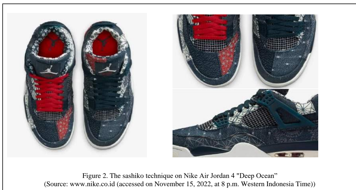
Figure 2. The sashiko technique on Nike Air Jordan 4 "Deep Ocean"