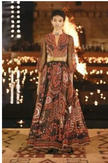
Figure 8. Dior Cruise 2020 collection

The unique motifs of the African traditional fabric named “wax fabric” have inspired the fashion house “Dior” in the Dior Cruise 2020 Collection. The fabric motifs largely play with line, tribal, floral, or fauna patterns according to the natural landscapes in Africa. With varied colors, these motifs are suitable for use in clothing, whether it be a blouse, skirt, headband, or men’s suit. It is important for designers to understand that each element of a pattern carries a special meaning in its whole and that it is a challenge to arrange different elements of a pattern to attain balance, rhythm, proportion, emphasis, and unity in a single design (Debeli, 2013.).