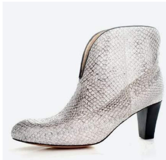
Figure 5. One of the salmon fish-skin pairs of shoes produced by Atlantic Leather

rare species, hence not threatening biodiversity ( Rahme & Hartman, 2006 ). These fish include the salmon, perch, wolf fish, and cod. The fish-skin processing works with three sustainability aspects: economic benefits from value creation from waste; social benefits from reconciling sustainability with exotic, fashionable fish leather; and environmental benefits from producing leather without harming threatened animals (Mould, 2018 in Palomino et al., 2020 ).