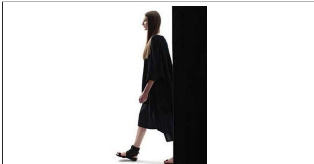
Figure 10. One of the items in the Exception Spring 2013 Collection

In general, designers with “Zen” philosophy in mind use neutral colors, natural materials and dyes, and simple fabric cuttings to deliver the Zen spiritual messages: peace, tranquility, austerity, and harmony. For instance, the designer Uma Wang in many of her works use neutral colors with light cuttings. The Zen philosophy sprung from an adopted knitting skillset that becomes a signature in her works.