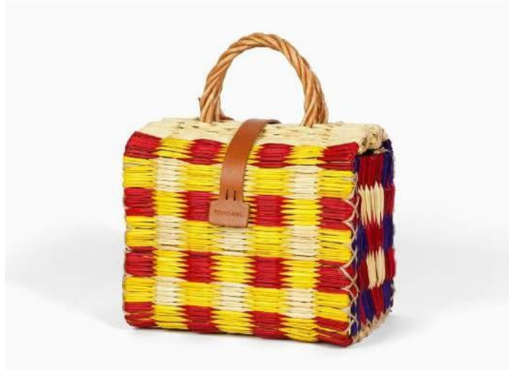
Figure 4. One of Taino Abel handbags

with reeds as the raw materials. The reeds are collected along Tagus River and dyed traditionally using plant-based natural dyes ( Delgado et al., 2015 ).