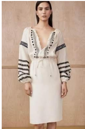
Figure 7. Joseph Altuzarra’s Resort 2015 Collection

Some designers derive inspiration from Romanian traditional costumes in their works. The French designer Philippe Guilet in a 2011 collection, “Prejudice 100%.RO”, presented a traditional cap that was reinterpreted with a modern element whose inspiration came from a horse rider costume. Joseph Altuzarra, another French designer, with an American brand Altuzarra in the Resort 2015 Collection presented colorful garments, blouses alike to Romanian costumes, and pencil skirts with ethnic motifs. The American brand Anthropologie in its Fall/Winter 2011 Collection was inspired by Romanian folk costumes from Maramureş ( Kaya, Ö., 2021 ).