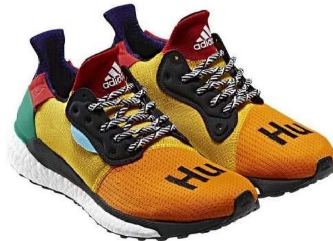
Figure 9. Adidas x Pharrell Williams SOLARHU

SOLARHU Fall/Winter 2018 Collection, puts on show a collection of unique sport footwear and apparel. This uniqueness is apparent in the African motifs and typical colorways, which is a rarity for Adidas.