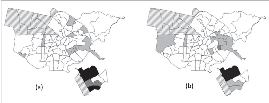
Figure 1. Distribution of Authorized (Left) and Unauthorized (Right) Surinamese Across Amsterdam

Sources: Statistics Netherlands (authorized immigrant population); police apprehension data (registered residential addresses unauthorized population), 1997-October 2003.