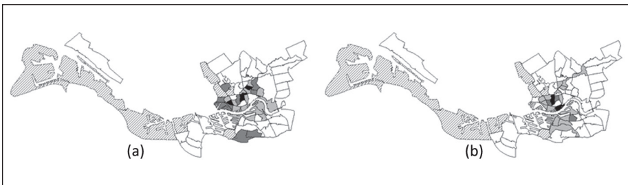
Figure 2. Distribution of Authorized (Left) and Unauthorized (Right) Eastern Europeans Across Rotterdam