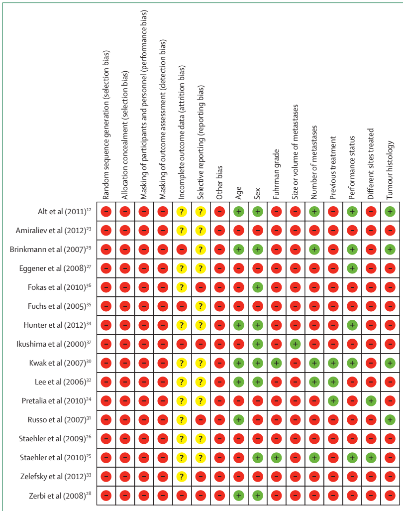
Figure 3: Risk of bias and confounding assessment summary Green circle=low risk of bias and confounding. Red circle=high risk of bias and confounding. Yellow circle=unclear risk of bias and confounding.

improvement in 2-year intracerebral control was found when adding WBRT to SRS compared with SRS alone (p=0.032), but no such difference was noted for 2-year overall survival (p=0.703); both were superior to WBRT alone in the general study population (all p<0.001) and in the RPA subgroup analyses (all p<0.001). In a subgroup analysis of RPA class I, the comparison of SRS with SRS plus WBRT revealed significantly better 2-year overall survival and intracerebral control for the combination group (p<0.001 for both). The other study 37 compared fractionated stereotactic radiotherapy (FSRT) with metastasectomy plus CRT, or CRT alone. Only six (55%) patients after metastasectomy plus CRT and four patients (33%) after CRT were followed up with imaging. Several of the patients in all groups underwent alternative surgical and non-surgical treatments after initial treatment. Survival at 1, 2, and 3 years were 90%, 54%, and 41% for FSRT, 64%, 27%, and 9% for metastasectomy