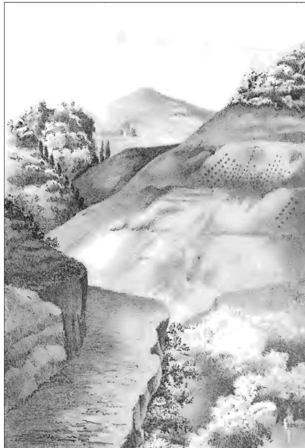
Figure 2: Cupmarks on rocks.