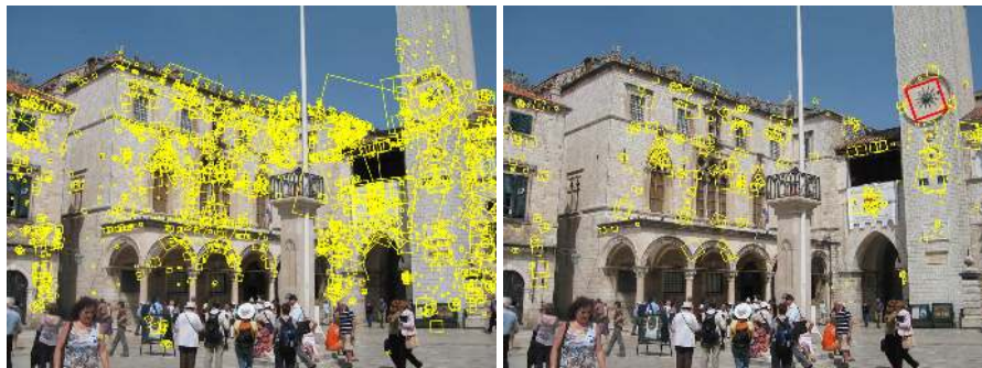
Fig. 1. SIFT Features in an image corresponding to reconstructed 3D points in the full model (left) and the compressed model (right) for Dubrovnik. The feature corresponding to the most visible point (i.e., seen by the most number of images) is marked in red in the right-hand image. This feature, the face of a clock tower, is intuitively a highly visible one, and was successfully matched in 370 images (over 5% of the total database).

to any other photo—we remove these from consideration, as well as other very small connected components). For instance, the Rome dataset described in Section 5 consists of 69 large components. An example 3D reconstruction is shown in Figure 2. Each reconstruction consists of a set of recovered camera locations, as well as a set of reconstructed 3D points, denoted P . For each point p \in P , we know the set of images in which p was successfully detected and matched during the feature matching process (and deemed to be a geometrically consistent detection during SfM). We also have a 128-byte SIFT descriptor for each detection (we will assign the mean descriptor to p ). Given a new query image from the same scene, our goal is to find correspondences between these scene features and the query image, then determine the camera pose.