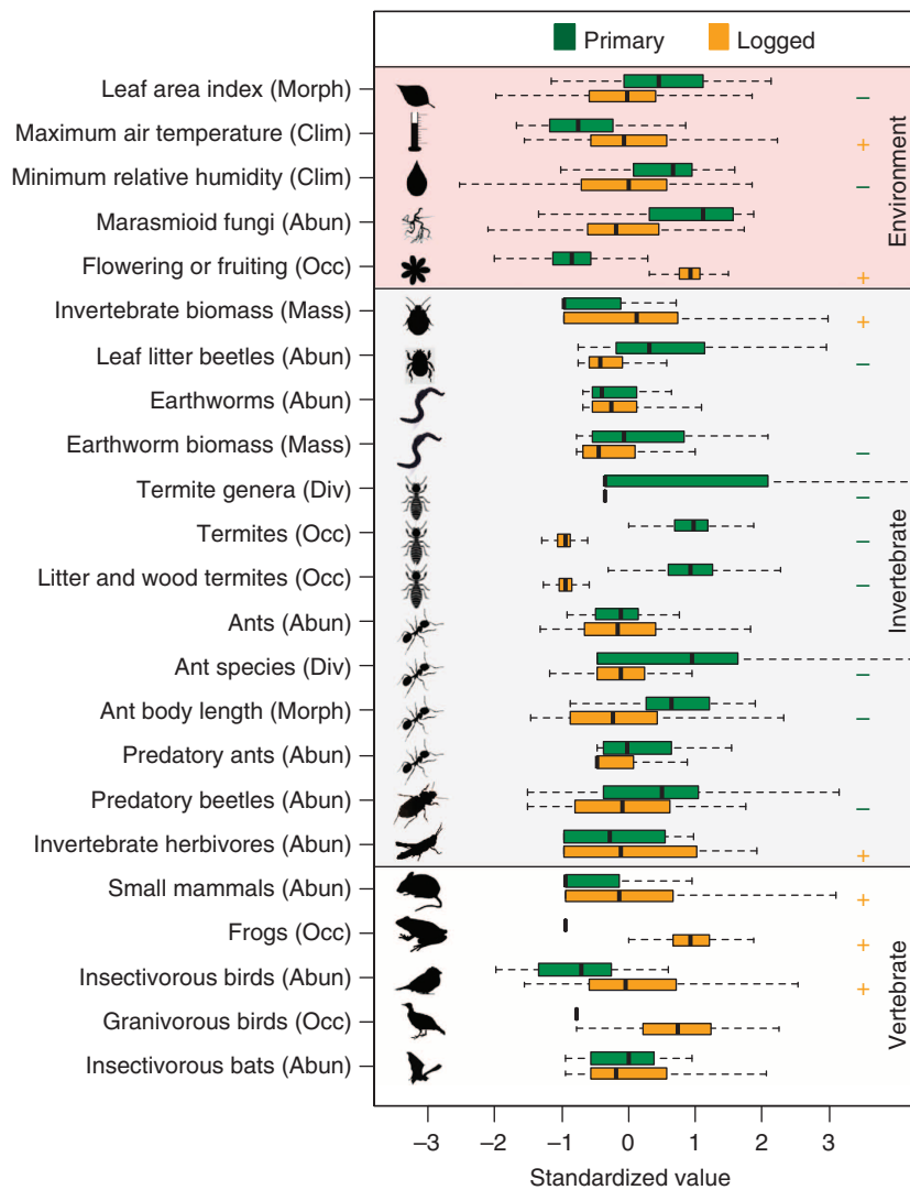
Figure 2 | Differences in the physical environment and the functional composition of invertebrate and vertebrate communities between primary and logged tropical rainforest. Response variables fall into the categories of microclimate (Clim), morphology and structure (Morph), biomass (Mass), diversity (Div), occurrence (Occ) and abundance (Abun). Invertebrate groups tend to be more abundant in primary than in logged forest, whereas the reverse is generally true for vertebrate groups. For comparison, all values were standardized to represent standard deviations from the mean. Dark lines represents the median, boxes the first and third quartiles, and whiskers the range. Significant differences ( P < 0.05 ) from mixed effect models on untransformed data are indicated with a green minus (–) or orange plus (+) sign if the effect of logging was negative or positive.

We found similar results in predation experiments quantifying the rate at which live mealworms tethered to artificial leaves were predated. Predation rates decreased by 96% in primary forest when invertebrates were excluded (Fig. 1f). In logged forest, however, invertebrates contributed just 62% of all predation (Fig. 1e,f; habitat × treatment interaction effect: likelihood ratio test, \chi^2_{(2)} = 10.77, P = 0.005, N = 51 ; Supplementary Table 2). Excluding vertebrates, such as insectivorous birds and bats and small mammals such as treeshrews that forage in the understorey, also reduced predation of invertebrates in primary forest (48%), but their contribution to predation was significantly higher in logged forest (69%).