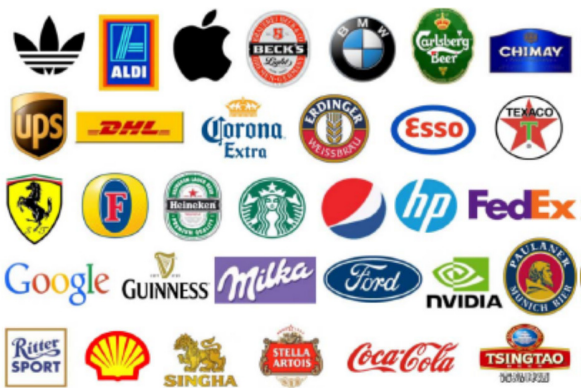
Fig. 3. The 32 classes of the FlickrLogos-32 dataset.

In order to evaluate the proposed model, the FlickrLogos-32 logo recognition dataset [7] was used for training and testing. FlickrLogos-32 is a publicly-available dataset with a collection of 8240 real-world images of 32 different brand logos from Flickr and it was built for the evaluation of logo retrieval and multi-class logo detection and recognition systems. The dataset was divided into three separated subsets: P1, P2, and P3. Each subset contains images of all the 32 classes. The training set P1 contains 320 images, 10 images per class, while both the validation set P2 and the test set P3 consist of 3960 images each containing both 30 positive examples per class and 3000 negative examples containing no logos. Figure 3 shows sample images of 32 logo classes of the FlickrLogos-32 dataset. All experiments were performed using the CAFFE (Convolutional Architecture for Fast Feature Embedding) framework [16] on an NVIDIA Tesla K40c GPU with 12 GB RAM. CAFFE is a Deep Learning framework written in C++, with a Python interface. It supports many different types of Deep Learning architectures geared towards image classification and image segmentation.