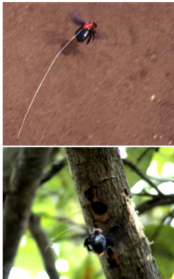
Fig. 3. Xylocopa flavorufa taking off (Upper) and returning to its nest (Lower).

If we consider the potential domesticated to wild cowpea gene flow, only one flight was between wild and domesticated cowpea (in the three recorded bouts, the field was the last place visited before returning to the nest). This ratio will increase slightly when wild plants are adjacent to domesticated cowpea fields, which is often the case in coastal Kenya. It should also increase much more in situations where wild cowpea plants are weeds