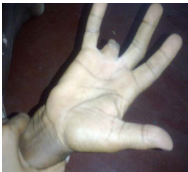
Figure 3 Amputation of ring finger of the right hand due to snakebite.

exposure to sunlight. In one, loss of vision was apparent. Russell's viper, cobra, and krait were the offending snakes in 42.9%. The complication was disabling with difficulty in reading and recognition of persons.