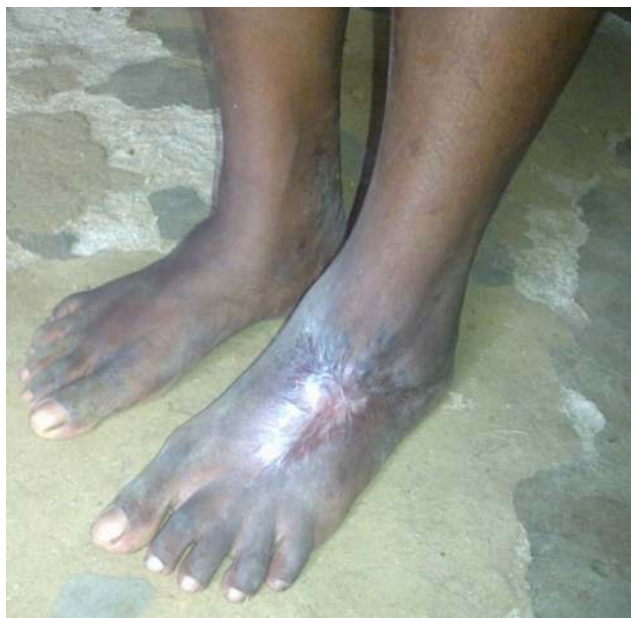
Figure 2 Soft tissue contracture of the left foot following snakebite.