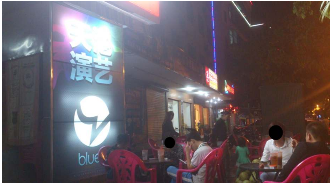
Figure 2. Blued sign outside Tianchi.

before the app became widely known and used, some men in Sanya believed that it was in fact the bar itself that was named 'Blued.' For Tianchi, a further benefit of this sign and its inclusion of Blued's logo was the way in which it tacitly announced the presence of a gay bar without the need for explicit terms to refer to sexuality. In the political and social climate of the PRC, and Hainan in particular, the use of terms such as 'gay,' 'tongzhi' or 'homosexual' in Tianchi's publicly visible signage could risk attracting unwanted attention from the general public and the authorities. It would also deter local non-heterosexual people from visiting the bar for fear of being seen entering. In this context, the illuminated logo of an app catering to men who desire men turned Tianchi into a visible non-heterosexual space while ensuring that it was visible as such only to those familiar with Blued.