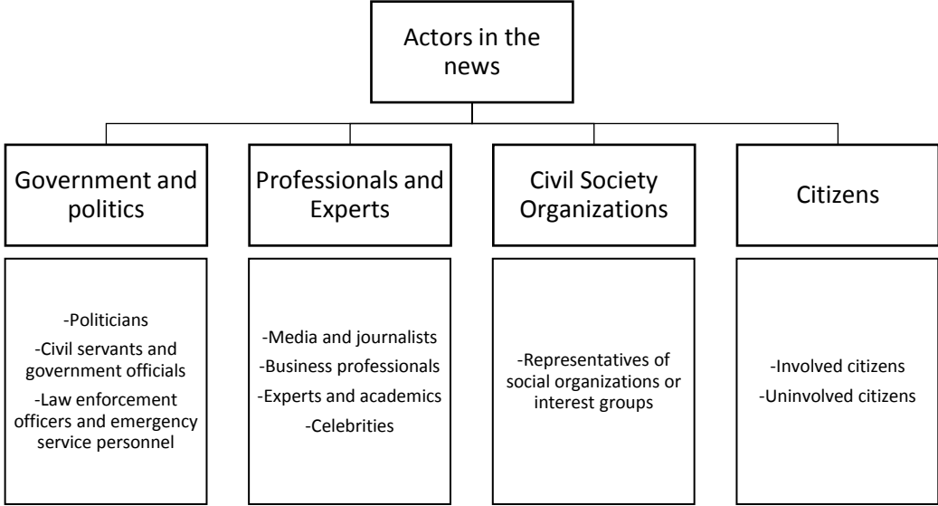
Figure 1. Actor classification across issues

The fourth category is labeled citizens , which consists of all ordinary citizens that appear in the news. This includes citizens that are affected by a news event, which we call involved citizens, such as victims, eye witnesses of a crime, or employees of a company that are on strike. These involved citizens should be distinguished from uninvolved citizens that do not have a specific representative function regarding the news event often labeled as vox pops. In recent years, citizens have been found to be used as news sources more often in traditional news media (De Keyser et al. 2011; Hopmann & Shehata 2011; Kleemans et al. 2015), supporting our choice to classify citizens in a separate category.