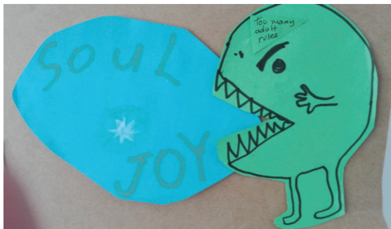
Figure 2: Creative expression from youth focus group: “Shitty adult rules are eating our soul/joy”.

this was done by externalising (for example, through a fictional character created for an animation), and occasionally in a more open way by sharing their personal experiences with the group. For one participant, Express Yourself helped them “disrupt repetitive thought patterns”, while another said it helped them to “think about things in my life in different ways—especially working with images”. Another said “I come to learn about myself and relationships”, while a different participant explained that “it teaches useful tips and ideas for dealing with things”. The creative process was described as a safe way to reflect on, share and reframe negative life stories. Doing this among peers in a supportive environment enabled important peer validation and support networks, and modelling of pro-social behaviours. Importantly, individuals also talked about how this process enabled them to be brave and take risks and practice new confidence or behaviours: “I didn’t like it but I gave it a go and no one laughed”. Participants were then encouraged to transfer this to other environments. A number of participants in the second focus group engaged in a discussion about how the arts offer different ways of saying things enabling self-expression, especially in difficult situations.