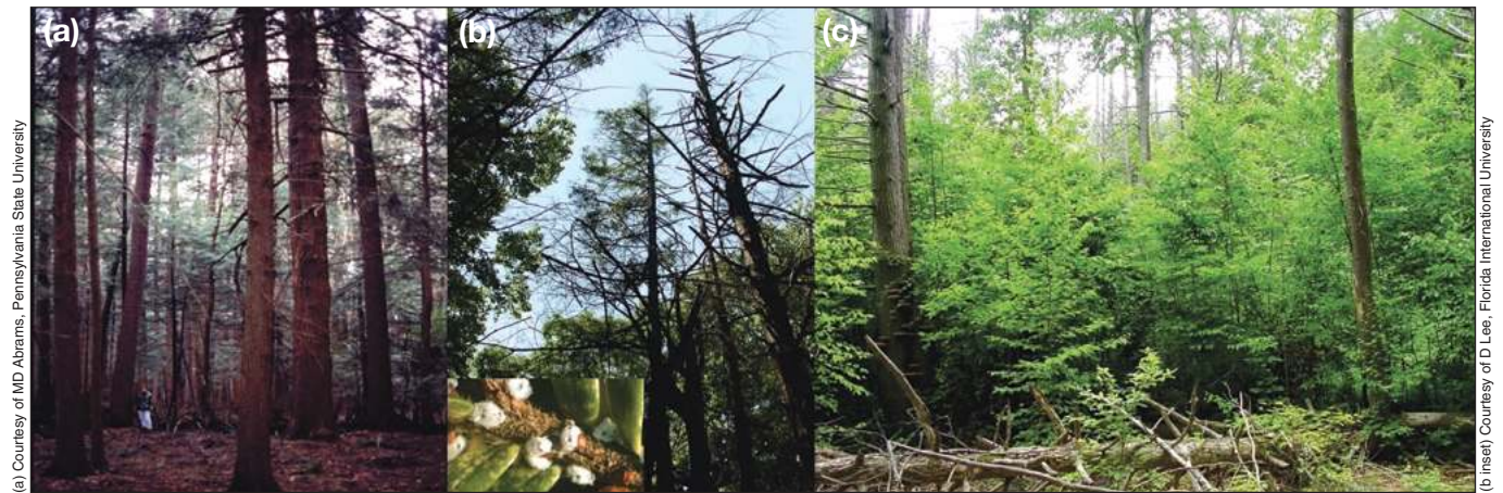
Figure 1. (a) An old-growth eastern hemlock ( Tsuga canadensis ) stand, (b and inset) a stand declining following 10 years of infestation by the introduced hemlock woolly adelgid ( Adelges tsugae ), and (c) dense regeneration of black birch ( Betula lenta ) saplings on a site formerly dominated by eastern hemlock in southern Connecticut. Nearly all hemlock trees in this 150-hectare forest in southern Connecticut were killed in the mid-1990s by hemlock woolly adelgid.

cal makeup contribute substantially to ecosystem processes. Foundation tree species are declining throughout the world due to a number of factors, including introductions and outbreaks of nonindigenous pests and pathogens, irruptions of native pests, over-harvesting and high-intensity forestry, and deliberate removal of individual species from forests. We use three examples from North America to illustrate consequences for both terrestrial and aquatic habitats of the loss of foundation tree species: the ongoing decline of eastern hemlock ( Tsuga