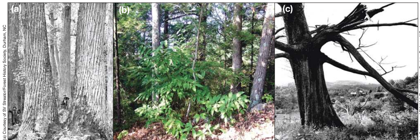
Figure 4. American chestnut. (a) Chestnut timber, Great Smoky Mountains of western North Carolina (circa 1910), a foundation species that was transformed in the mid-20th century to an understory shrub (b; small shrub in center) by the introduced pathogen Cryphonectria parasitica , which causes chestnut blight (c; chestnut in the Blue Ridge Plateau killed by the blight, circa 1946).

stream macroinvertebrates have life cycles closely synchronized to the dynamics of detrital decay, and this change in detrital quality undoubtedly affected the macroinvertebrate assemblage, although there are no data to support this supposition. Furthermore, slowly decomposing chestnut wood persists for decades in stream channels, altering channel structure and providing habitat for fish and invertebrates. For example, in an Appalachian headwater stream sampled in the late 1990s, Wallace et al. (2001) found that 24% of the large (> 10 cm diameter) woody debris still consisted of American chestnut that had died over 50 years earlier.