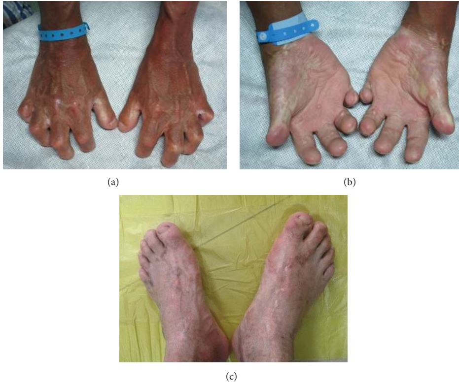
FIGURE 1: Hands and feet images. (a) Opisthenar; (b) palm; (c) feet. Clinical examination reveals fingers, especially the first and second phalange, were shorter and cannot full straighten. His palms and soles were hyperkeratosis. Fingernails and toenails were dystrophy.