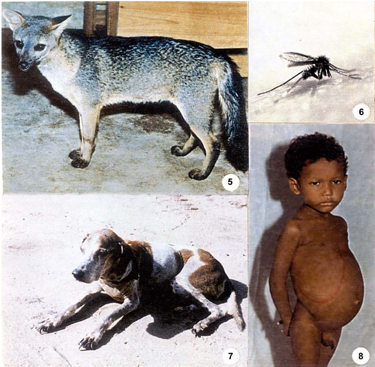
Figs 5-8: four fundamental factors in the establishment of a focus of Amazonian visceral leishmaniasis in the state of Pará, Brazil. Fig. 5: a natural reservoir host of the causative parasite Leishmania infantum chagasi , the fox Cerdocyon thous . Fig. 6: the sandfly vector Lutzomyia longipalpis . Fig. 7: infected domestic dogs, which become the major source of human infection (Fig. 8).

During studies on leishmaniasis in the Amazon region of north Brazil by workers in the Instituto Evandro Chagas, a total of 2637 wild animals were examined for leishmanial infection, including rodents, marsupials, procyonids, canids and edentates (Lainson et al. 1987): this list in-