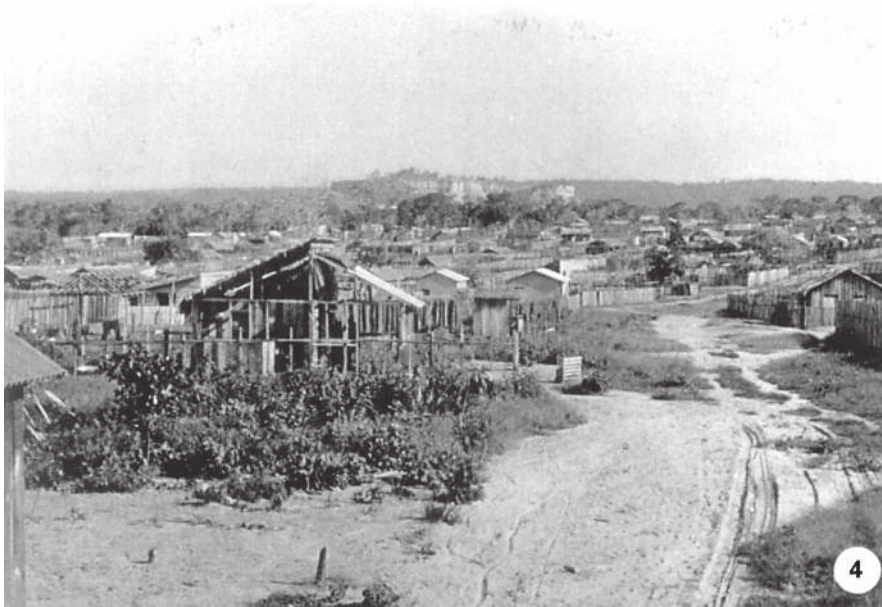
Fig. 4: final stage in the formation of a focus of Amazonian visceral leishmaniasis. Disorganised growth of a shanty-town, high density of the sandfly vector and an abundance of dogs. Outskirts of Santarém, Pará, North Brazil.

Mangabeira (1969) first drew attention to small morphological differences between male examples of Lu. longipalpis from Ceará, Northeast Brazil, and others from Pará, North Brazil, and Lainson and Shaw (1979) suggested that the presence of "...a Lu. longipalpis complex of very similar sandflies...may account for certain anomalous situations" and that "a taxonomic revision is needed of... Lutzomyia longipalpis "