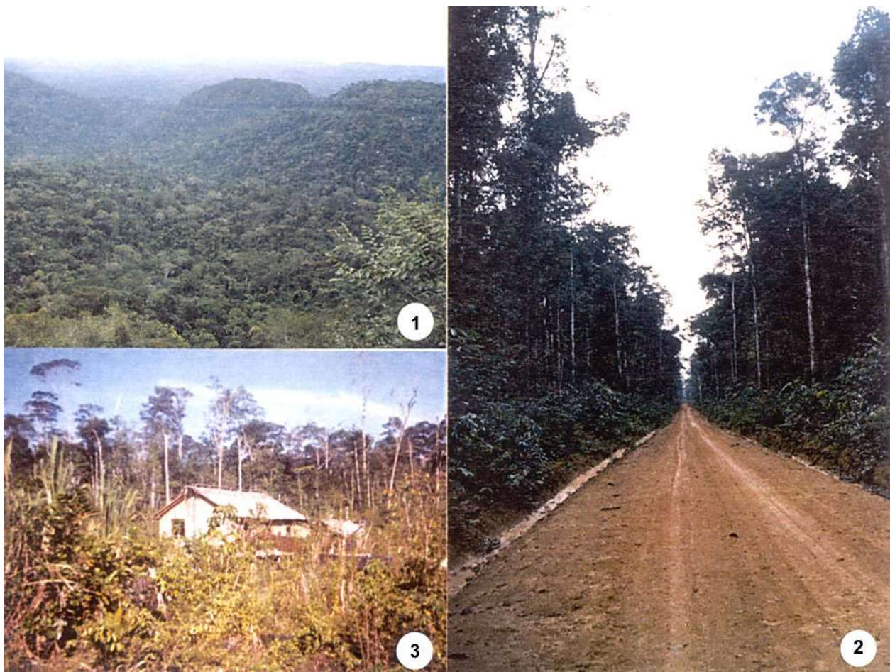
Figs 1-3: stages in the development of foci of leishmaniasis in Pará, Amazonian Brazil. Fig. 1: primary forest in the Serra dos Carajás, where the sandfly vector Lutzomyia longipalpis forms part of the phlebotomine fauna. Figs 2, 3: the margins of new roads cut through the forest (Fig. 2) are soon occupied by rustic houses (Fig. 3), with a subsequent infestation of chicken houses and other animal shelters by Lu. longipalpis coming from the adjacent forest.

tably with dogs, chicken houses and other animal shelters, are rapidly thrown up along their length, in very close proximity to the forest edge. Lu. longipalpis females have catholic feeding habits and quickly invade such habitations: thus, in an epidemiological investigation of cases of AVL along the forest-fringed Igarapé Miri-Tucuruí highway this sandfly was found in the chicken houses of numerous widely separated houses only 18 months after the road had been opened (Lainson, Shaw, Silveira & Souza, unpublished observations). Finally, even more conclusive evidence came from studies in the municipality of Salvaterra, Island of Marajó, Pará, in a focus of AVL (Lainson et al. 1990). Using CDC light-traps variously placed over caged chicken, a fox, and sawdust impregnated with the urine and faeces of a fox, attempts were made to capture Lu. longipalpis in a pocket of residual primary forest, the back-yard of a house some 500 m distant, and neighbouring open savanna. During the dry season, 80 trapping-nights in the forest produced a total of 47 of these sandflies, consisting of 22 males and 25 females: none were caught following 14 captures in the savanna, and 2 captures in the back-yard of the house