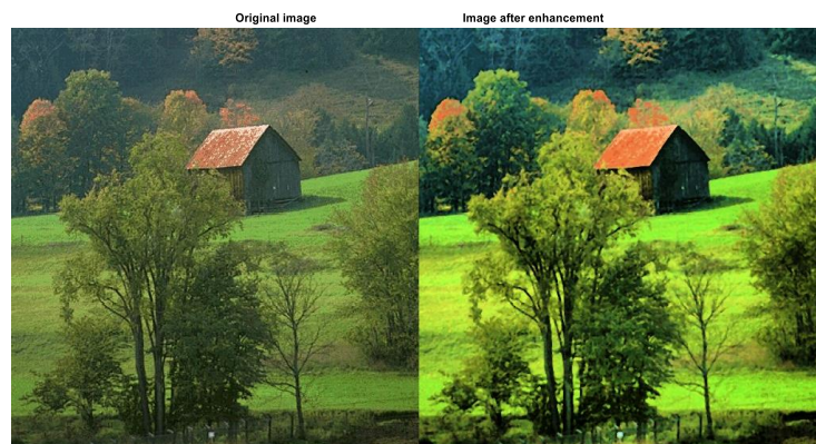
FIGURE 3. Original image versus Enhanced image (Barnfall)

Figures 3 and 4 shows two of the test images (Barnfall and Bodie (512 X 512 pixels)) obtained from the Computer Vision Database and the resulting outputs after enhancement using the proposed algorithm.