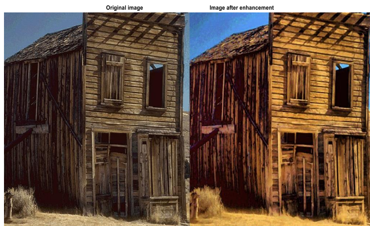
FIGURE 4. Original image versus Enhanced image (Bodie)

In Figure 3 the effective image details enhancement can be observed from the variation of color intensity of green grasses in different area, the roofing sheet rusty color and clearer presentation of details of wire fence at the bottom of the image this can also be observed in Figure 4 on clearer appearance of details of the whole plank house frame, the dimension of the planks use for support of the window by the side and blue color intensity of the sky.