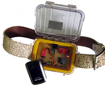
Fig. 2: LynxNet collar device.