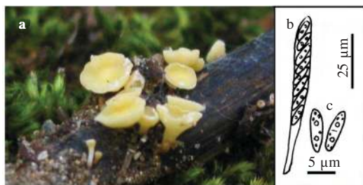
Figure 2. Phaeohelotium umbilicatum . a. Ascocarps, b. Ascus, c. Ascospores.

Fruit body 1-3.5 mm across, turbinate when young, then expanded flat, convex to umbilicate. Hymenium smooth, lemon yellow, darker at the centre, in some samples margin weakly notched (Figure 2a). Stipe 1-2.5 mm long, cylindrical, tapering toward the base. Ascii 90-100 × 9-10 µm, and eight-spored. Spores 13-16.5 × 4-4.5 µm, elliptical-cylindrical, smooth with drops (usually 2 large and a few smaller) (Figure 2b).