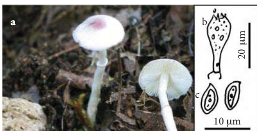
Figure 4. Leucoagaricus erioderma . a. Basidiocarps, b. Basidium, c. Basidiospores.

Cap 20-40 mm across, campanulate when young, later convex with an obtuse umbo, surface finely squamulose-fibrillose, remaining cream to lilac brown at the center, marginal zone fibrillose (Figure 4a). Flesh white, thin. Lamellae white. Stipe 25-55 × 4-8 mm, cylindrical, white, sericeous above the persistent white annulus, squamulose below. Basidia 18-24 × 4-4.5 × 8-9 μm, clavate. Spores, 6-7.5 × 3-4 μm ovoid to subamygdaliform (Figure 4b).