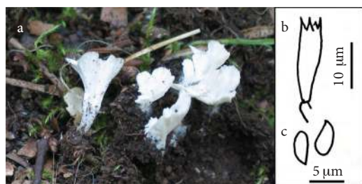
Figure 7. Cotylidia diaphana . a. Basidiocarps, b. Basidium, c. Basidiospores.

Cap 15-25 mm tall and 10-30 mm across, thin, funnel-shaped, sometimes spathulate, striate and usually split at the margins. White when young, becoming creamy when dry, sometimes with fine radial fibrils (Figure 7a). Hymenial surface smooth, sometimes radiately wrinkled, concolorous with the upper surface. Stipe 5-15 × 1-2 mm, solid, smooth, white, in some samples tomentose at the base. Basidia 18-27 × 5-6 µm, slenderly clavate. Spores 4-6.5 × 2.5-3.5 µm, hyaline, elliptic, smooth (Figure 7b).