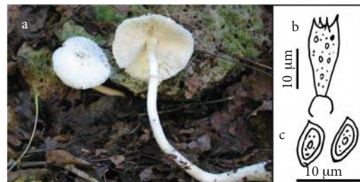
Figure 5. Leucoagaricus serenus . a. Basidiocarps, b. Basidium, c. Basidiospores.

Cap 30-50 mm across, campanulate when young, later convex to plane, with an umbo, white, surface finely fibrillose especially at the margin (Figure 5a). Flesh white, thin. Lamellae white when young then cream-white, free. Stipe 40-70 × 5-8 mm, cylindrical, enlarged to somewhat bulbous at the base, surface white-fibrillose on a cream background, annulus membranous. Basidia 17-25 × 7-9 μm, clavate. Spores 7-9 × 4-5 μm, elliptical to amygdaliform (Figure 5b).