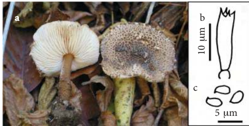
Figure 3. Lepiota jacobi . a. Basidiocarps, b. Basidium, c. Basidiospores.

up to 1 mm spiny structures on a beige to light brown background (Figure 3a). Flesh cream, thin. Lamellae cream, free. Stipe 20-50×3-6 mm, cylindrical, sometimes slightly broadened towards base, hollow, brown fibrillose above the annular zone and with woolly brown squamules below. Basidia 13-20 × 4-6 μm, narrowly clavate. Spores 3.4-5.2 × 2-3 μm, ellipsoid to oblong (Figure 3b).