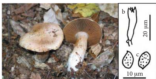
Figure 6. Cortinarius turgidus . a. Basidiocarps, b. Basidium, c. Basidiospores.

Laccaria laccata (Scop.) Cooke: On needle litter in Abies-Pinus forest, around settlement area, 36°58'42''N, 36°28'12''E, 1588 m, 26.10.2002, K. 1870.