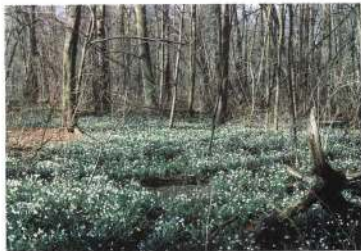
Fig. 2. Fragment of the park in Turów with blooming Lescocleis vernus