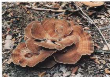
Fig. 3. Meriphan gyanus growing on the roots of living Ficus zylvestica