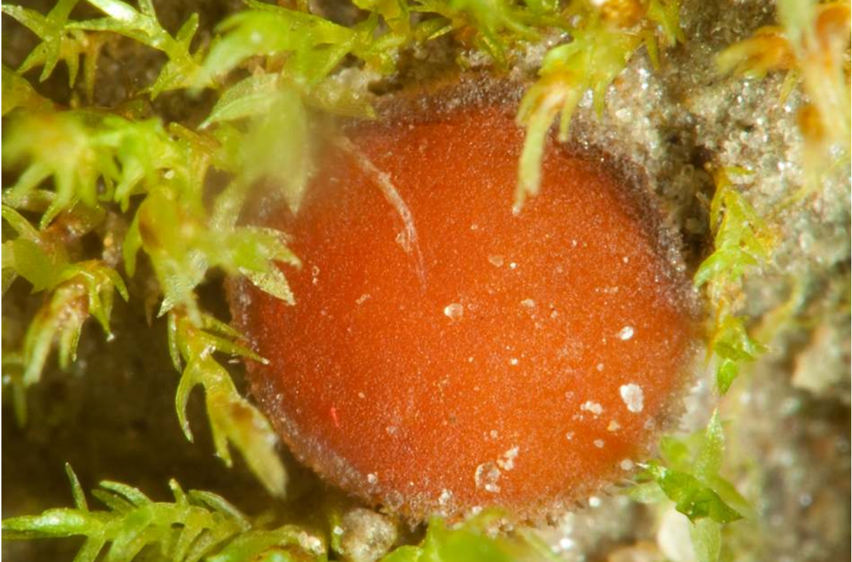
Fig. 13 Ascoma of Scutellinia torrentis (Rehm) T. Schumach. from the Bieszczady Mts (Aug 2, 2011).