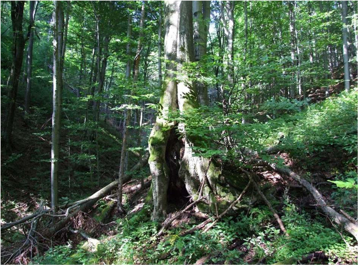
Fig. 2 Carpathian beech forest ( Dentario glandulosae-Fagetum ) on the slopes of the Otryt mountain range, Bieszczady Mts (Aug 16, 2009).