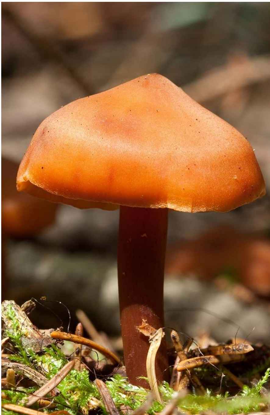
Fig. 12 Basidioma of Phaeocollybia jennyae (P. Karst.) Romagn. from the Bieszczady Mts (Aug 2, 2011).

valuable findings, as many fungal groups (genera Russula and Cortinarius , corticioid and hypogeous fungi, small Ascomycota) are still undercollected and underrepresented on the current species lists. Moreover, although field work has been conducted throughout the Bieszczady Mts, the greatest emphasis has been placed on the study of the Bieszczady National Park mycobiota. In consequence, the northern and western parts of the Bieszczady Mts have only been cursorily studied. Analysis of data on the Poloniny NP has showed that 462 species of macrofungi known from the Slovakian part of the Eastern Carpathians have not been observed yet in the Bieszczady Mts. Some of these, for example fungi inhabiting old oak trees and logs (e.g., Buglossoporus quercinus ), are unlikely to be collected in the Bieszczady Mts due to the absence of suitable habitats and substratum; however, most of these 462 taxa probably also grow on the Polish side of the border. Almost 1,840 macrofungi taxa are known from the Polish and Slovakian parts of the East Carpathian Biosphere Reserve.