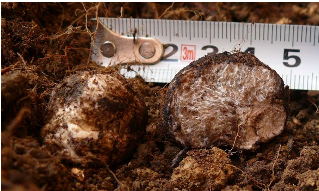
Fig. 11 Basidiomata of Octavianina mutabilis E. Bommer & M. Rousseau from the Bieszczady Mts (Nov 29, 2011).