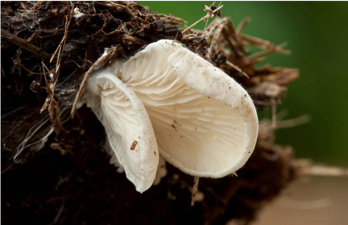
Fig. 9 Basidiomata of Clitopilus passeckerianus (Pilát) Singer from the Bieszczady Mts (Aug 1, 2011).