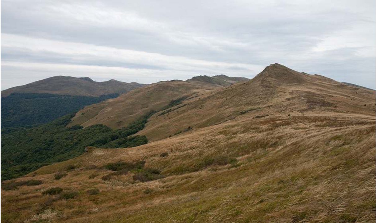
Fig. 5 Subalpine zone (polonynas) on Kopa Bukowa Mt, Bieszczady Mts (Sep 10, 2011).