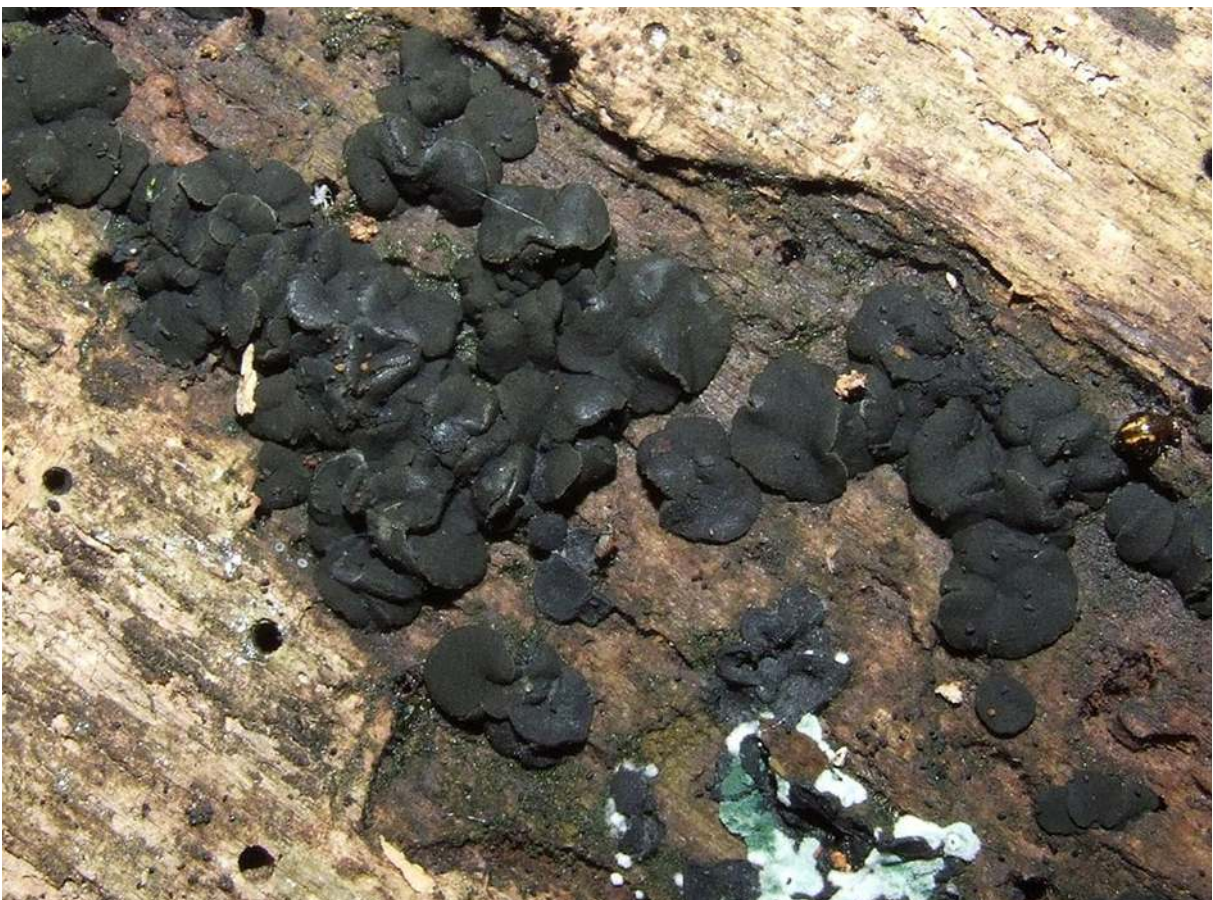
Fig. 8 Ascomata of Bulgariella pulla (Fr.) P. Karst. from the Bieszczady Mts (Aug 8, 2009).