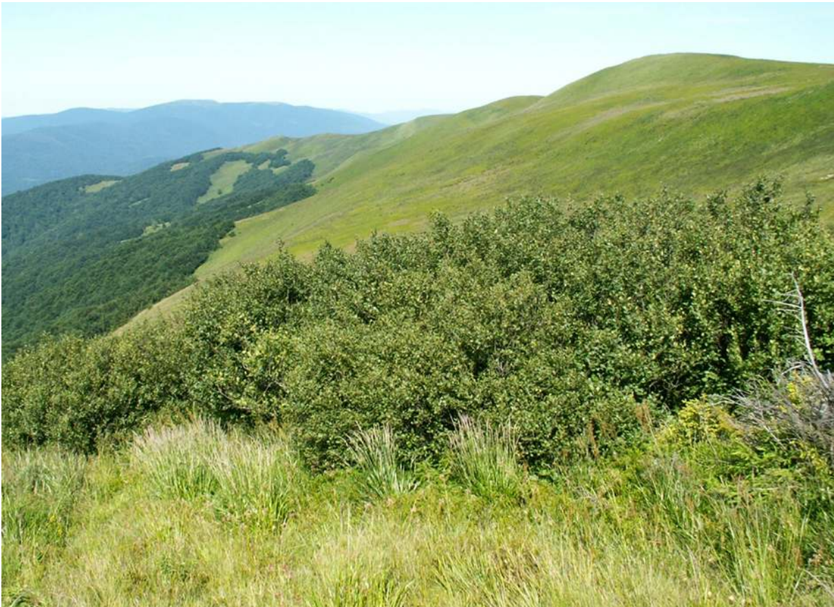
Fig. 4 Green alder ( Alnus viridis ) shrubs near Tarnica Mt, Bieszczady Mts (Jul 17, 2006).

feature for the Bieszczady Mts are the shrub communities with green alder (Fig. 4), Athyrio distentifoliae-Sorbetum alnetosum viridae , Pulmonario filarszkyanae-Alnetum viridis , Calamagrostis-Alnus viridis , or Salix silesiaca-Alnus viridis in subalpine areas. Hornbeam forests are rare and represented only by Tilio-Carpinetum ; additionally, common alder communities are extremely rare. The nonforest plant communities in the Bieszczady Mts were strongly influenced by the pasturage of sheep, goats, and horses in the past. Shepherding has resulted in the formation of unique landforms in the subalpine zone (above 1,200 m a.s.l.), called polonynas (Polish: poloniny ; Fig. 5), which are characteristic of the Eastern Beskidy Mts. Over 40 plant communities have been described in the subalpine zone of the Polish Bieszczady Mts. In the lower montane zone, over 50 types of nonforest plant communities are present. Of these, raised bogs ( Oxycocco-Sphagnetea ; Fig. 6), poor fens ( Scheuchzerio-Caricetea ), and poor meadows with Nardus stricta are the most valuable [3,5].