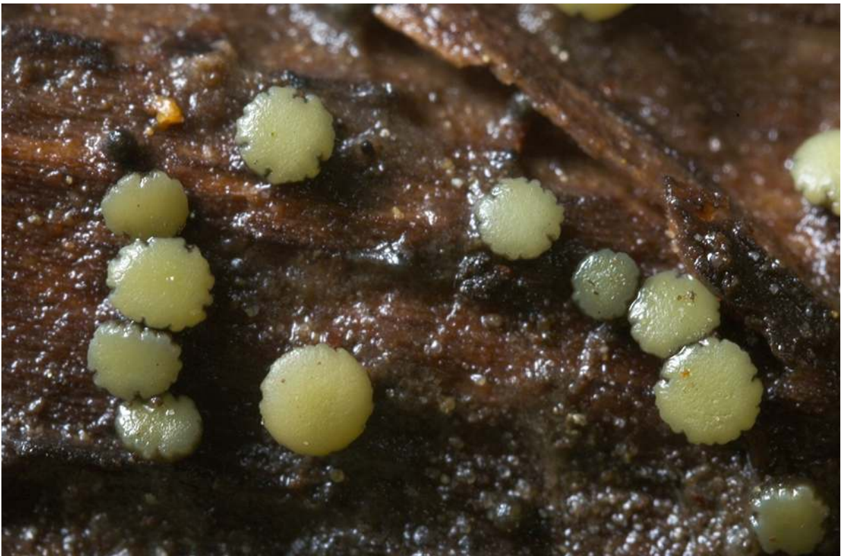
Fig. 14 Ascomata of Vibrissea decolorans (Saut.) A. Sánchez & Korf (Jun 3, 2010).