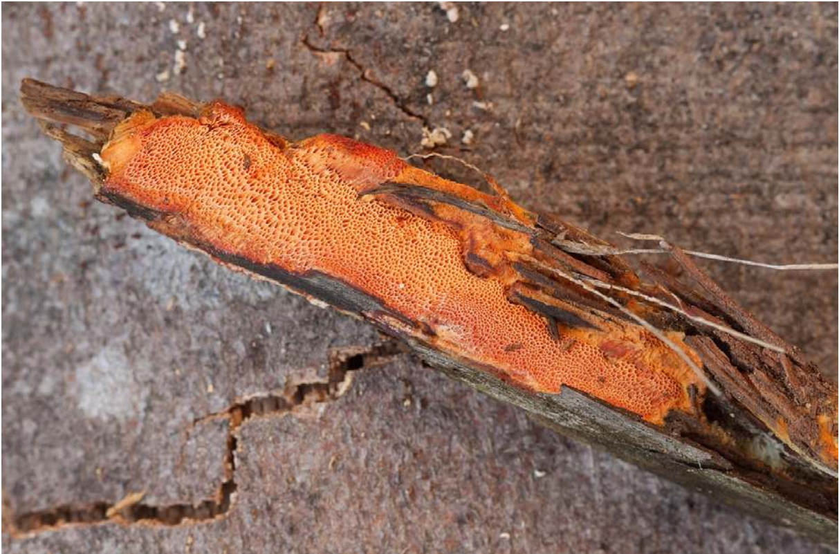
Fig. 7 Basidiomata of Auriporia aurulenta A. David, Tortič & Jelič from the Bieszczady Mts (Sep 5, 2011).