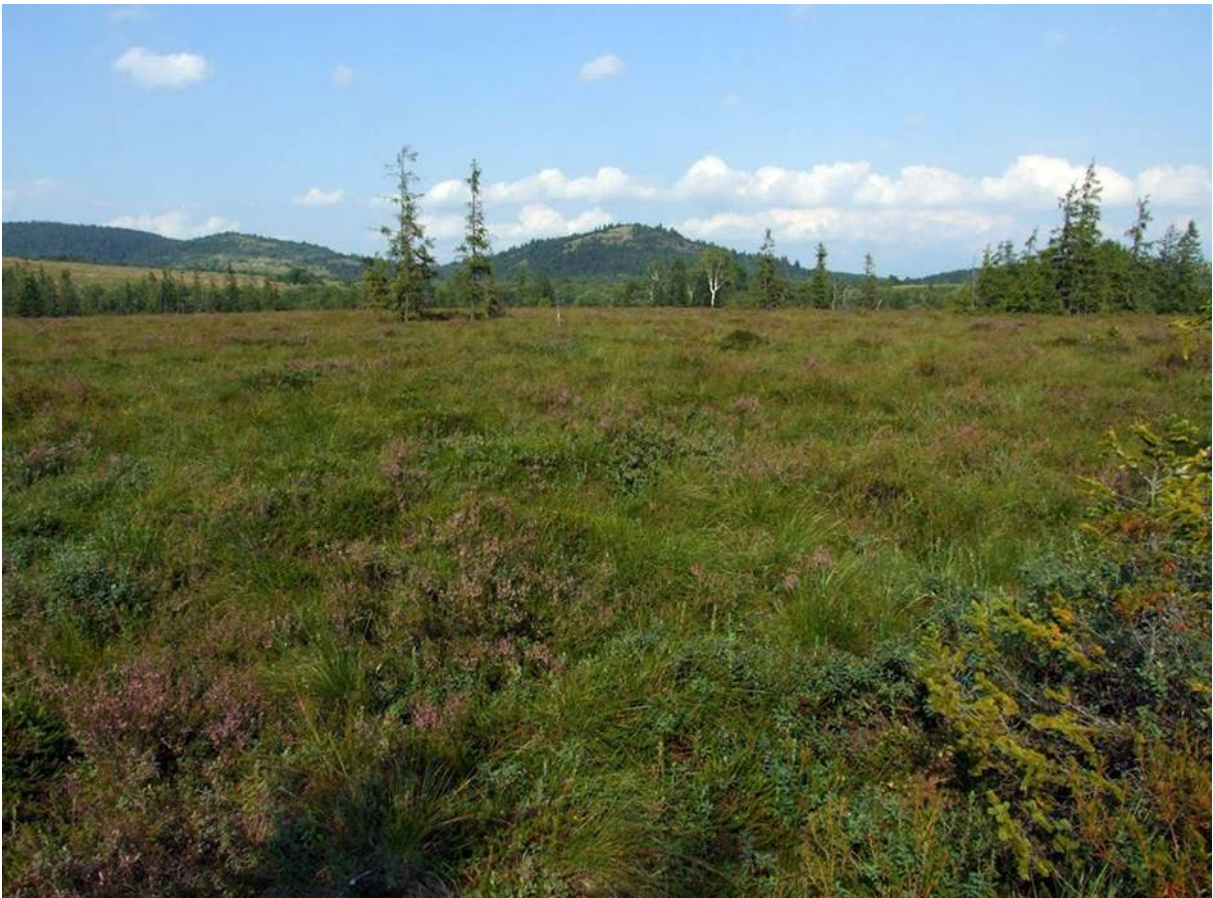
Fig. 6 Raised bog "Dzwiniacz" in the upper San valley, Bieszczady Mts (Aug 18, 2009).