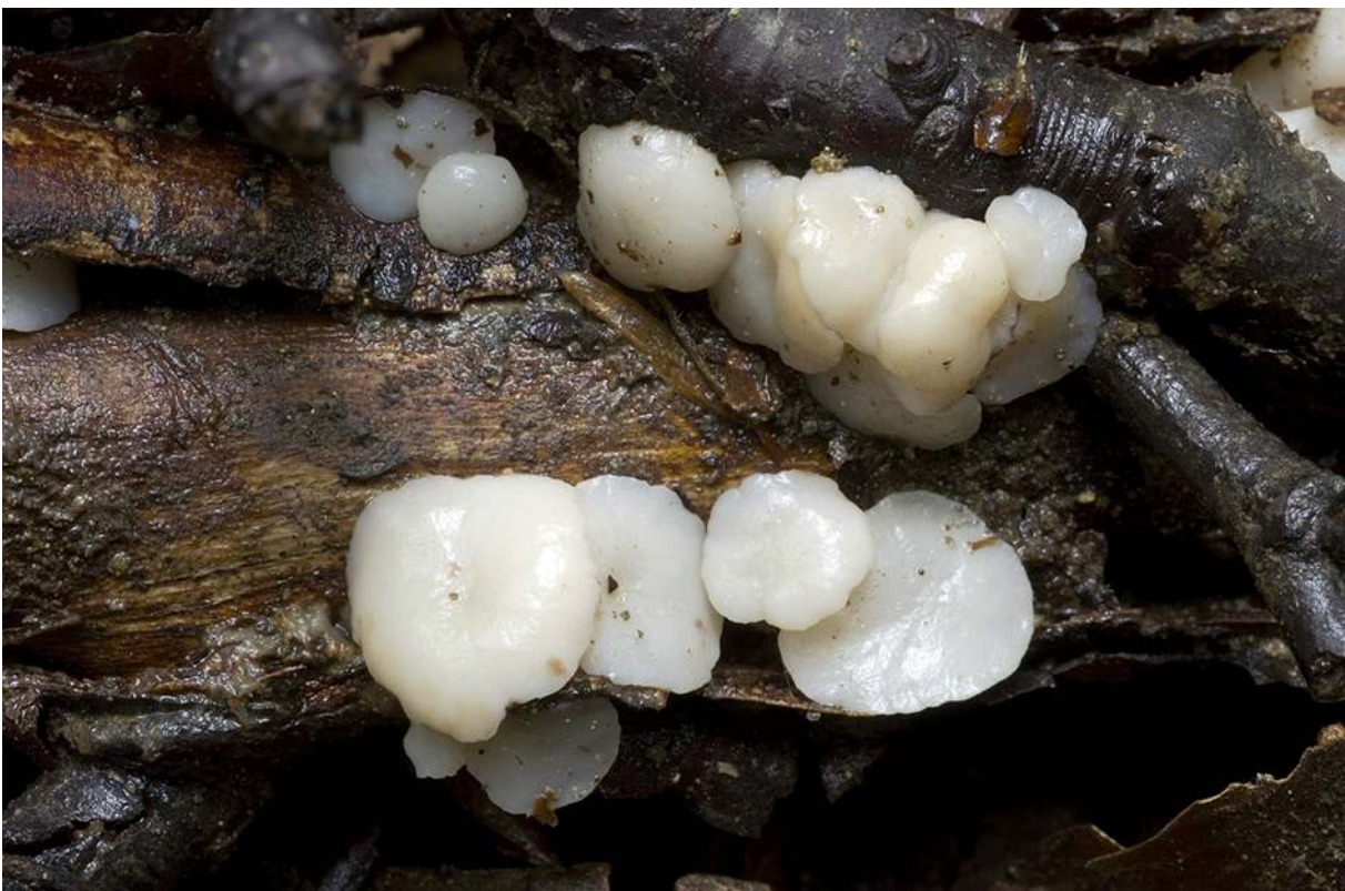
Fig. 10 Ascomata of Cudoniella tenuispora (Cooke & Massee) Dennis from the Bieszczady Mts (Jun 2, 2015).