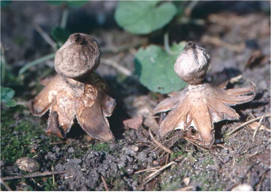
Fig. 4. Geastrum coronatum .