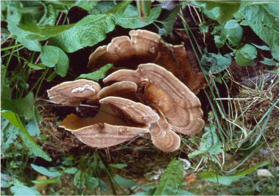
Fig. 6. Meripilus giganteus . Phot. A. Szczepkowski.