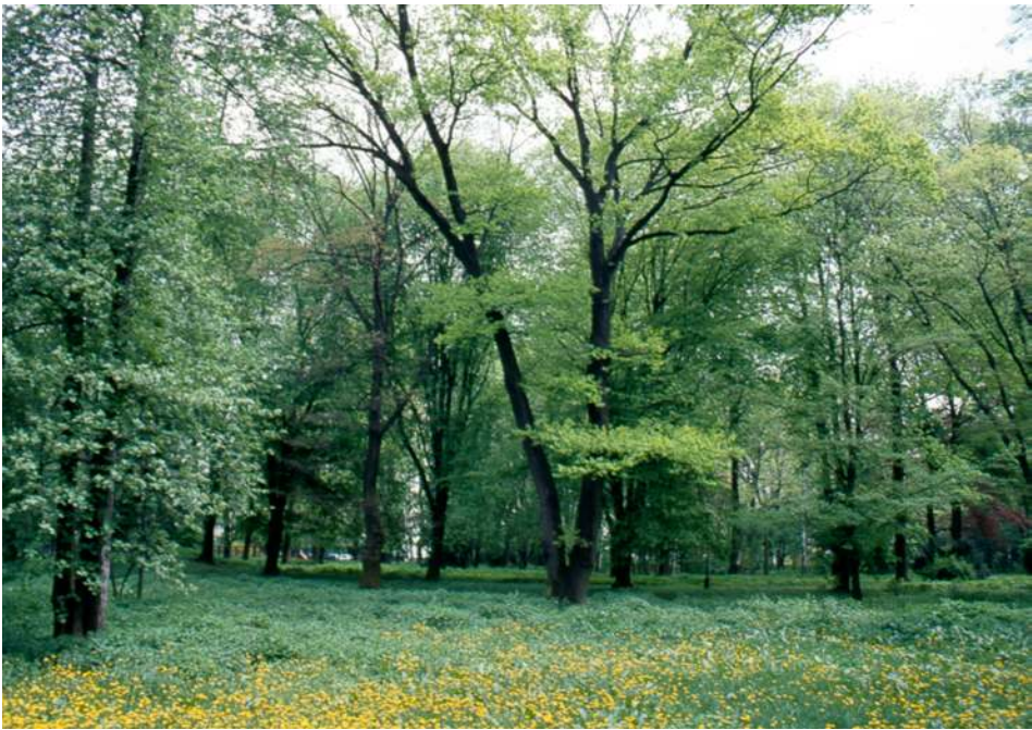
Fig. 3. The largest glade, formed after the removal of dying trees in the Dendrological Park, and its surrounding area.