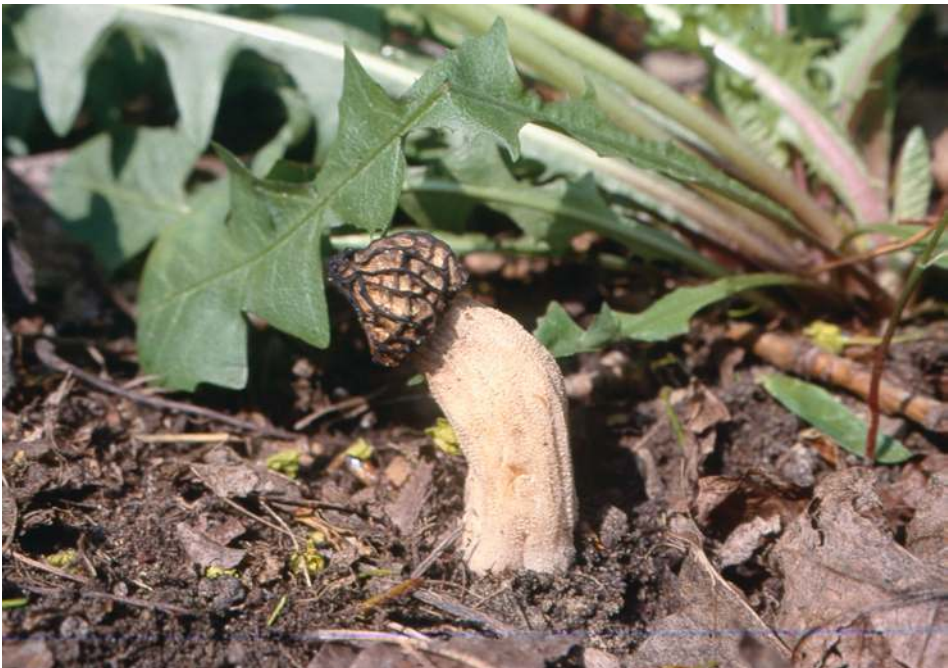
Fig. 7. Morchella semilibera .