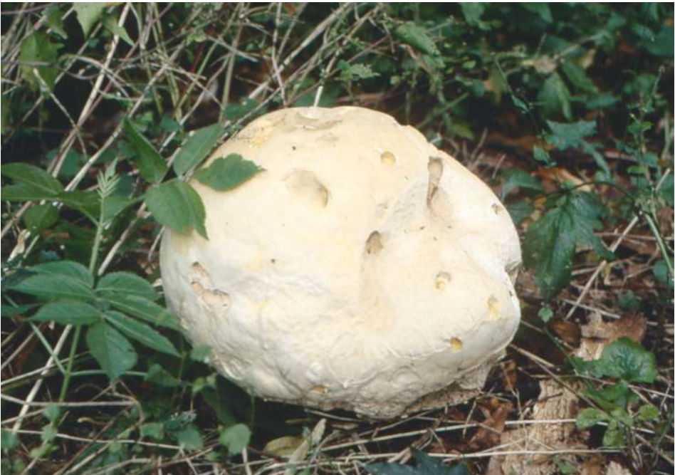
Fig. 5. Langermannia gigantea .