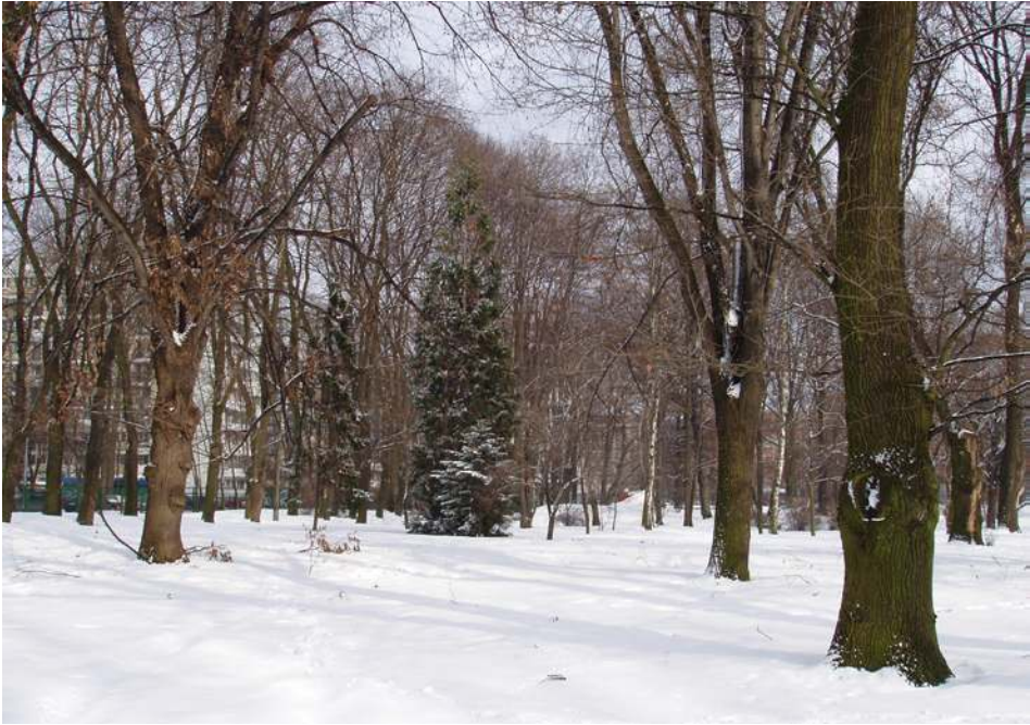
Fig. 2. Snow-covered Dendrological Park. Phot. A. Szczepkowski.