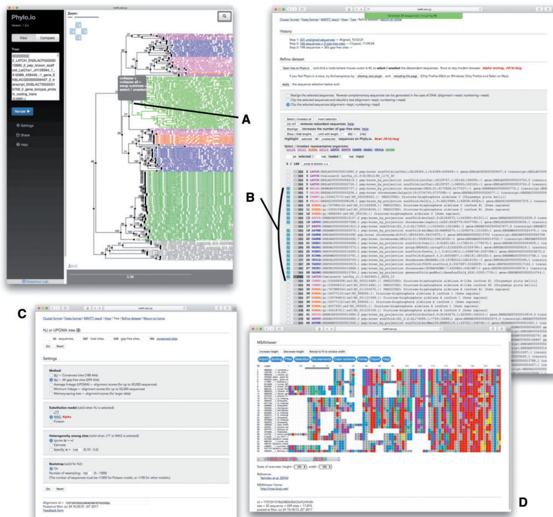
Figure 3. Interactive sequence selection. A group of sequences in guide tree (A) is selected at a time in sequence selection window (B). Several options for tree estimation can be selected (C). MSA can be visually checked using MSAViewer (D).

fragmentary sequences) and when the phylogenetic relationship between new sequences is not necessary to consider. There are several other tools, such as hmalign [25], PaPaRa [26] and PAGAN [27], to add sequences to an existing MSA.