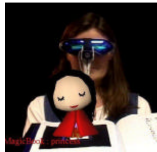
Fig 2: AR Scene

The MagicBook project explores transitional interfaces and how a physical object can be used to seamlessly transport users along the Reality-Virtuality continuum. We use a real book, so people can turn the pages, look at the pictures, and read the text without any additional technology. If they look at the pages through an AR display they see three-dimensional virtual models appearing out of the pages (fig. 2). The models appear attached to the real page so users can see the scene from any perspective simply by moving themselves or the book. Finally, readers can fly into the virtual scene and experience the story immersively (fig. 3).