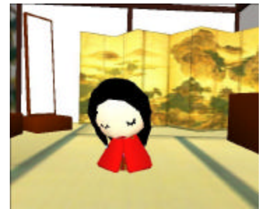
Fig 3: Immersive VR Scene

The MagicBook supports collaboration on three levels: