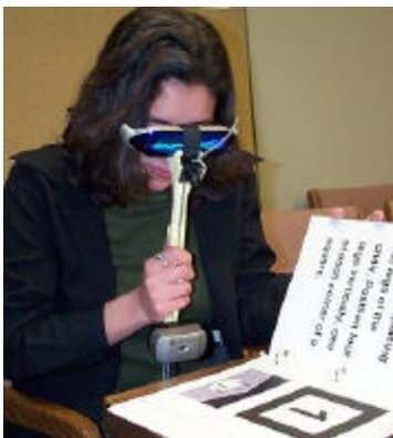
Fig 5: The MagicBook Handheld Display

The current MagicBook interface has two components; one or more handheld displays (HHD) and the physical book. The HHD is a handle with a Sony Glasstron display mounted at the top, an InterSense InterTrax inertial tracker at the bottom, a small camera on the front of the Glasstron display and a switch and pressure pad (figure 5). The Sony Glasstron is a biocular color display with two LCD panels of 265x235 pixel resolution. The camera output is connected to a desktop computer and the video-out of the computer is connected back into the HHD. So by looking through the HHD users experience a video-mediated reality.