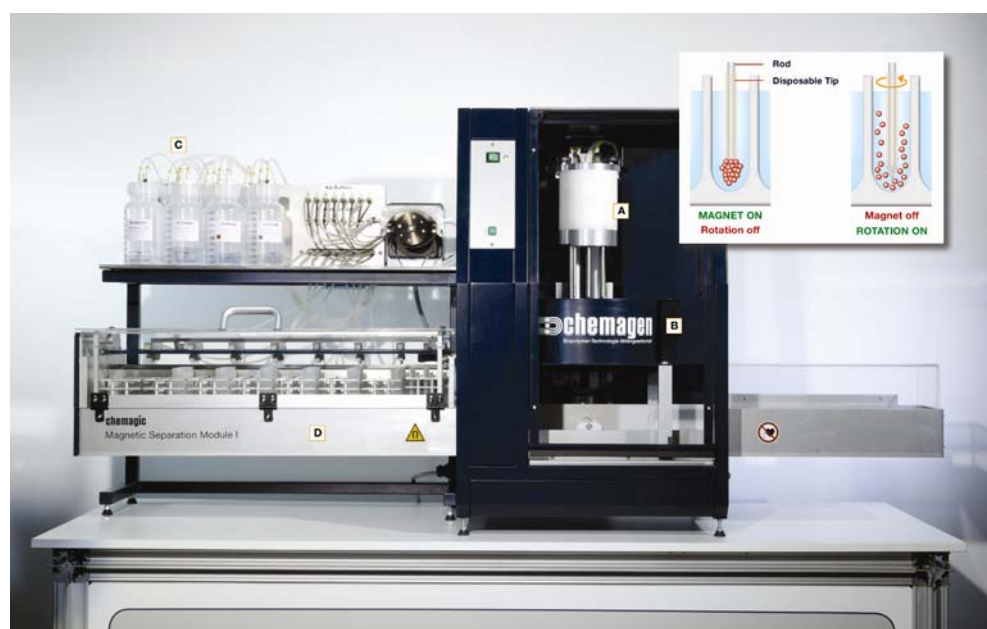
Fig. 2 chemagic Magnetic Separation Module I consisting of (A) separation head with magnetizable rods [here 12-well format for large (50 ml) volumes; 96-well format for MTPs also available], (B) electro magnet, (C) chemagic dispenser for parallel filling of all required buffer solutions (accessory) and (D) tracking unit. The principle functionality regarding separation and resuspension of magnetic beads is shown in the scheme

The present review has shown that the separation of nucleic acid is a highly dynamic field of research and development. An increasing number of commercial vendors offer magnetic particles, also in the form of a kit that is optimally suited for the application desired. The increasing number of publications shows that magnetic particles of higher