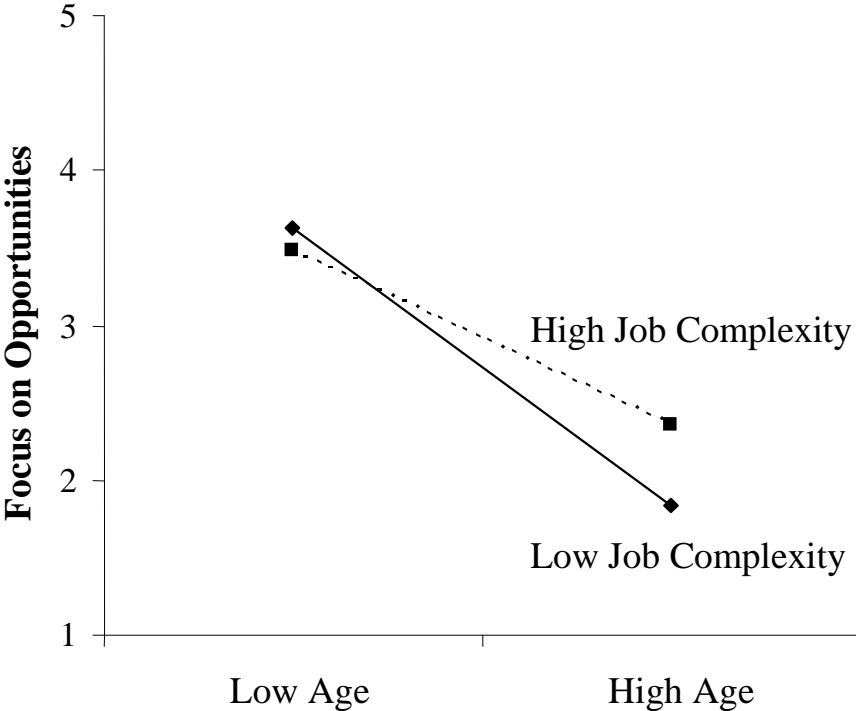
Moderation of the Relationship between Age and Focus on Opportunities by Job Complexity