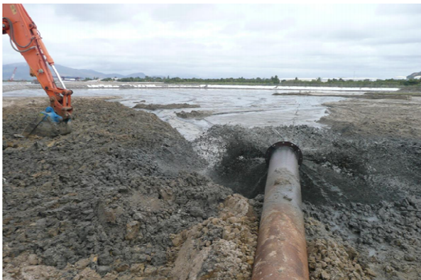
Fig. 4 Dredged material placement into port's ERA - 2011

One of the predominant aims of the 1996 Protocol is to have less and cleaner waste disposed at sea. This aim falls in line with Port of Townsville's strategy of reduction of the amount of dredge material to be disposed at sea and maximizing land reclamation alternative [5]. The current port's land based maintenance dredging material disposal is regulated by Queensland Environmental Protection Agency (EPA). EPA issues permit that outlines the maintenance dredging locations, depths, dredge plant to be utilised, quantities of material to be dredged and disposal locations. The option to have dredge material pumped ashore for land reclamation is created by the lack of land to satisfy the port infrastructure requirements and the need to handle contaminated dredged materials.