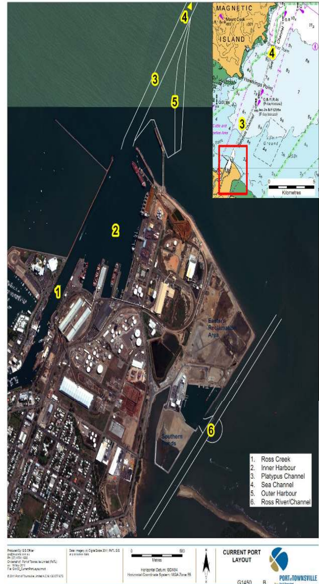
Fig. 2 Port of Townsville maintenance dredging locations

The Port of Townsville uses various types of dredging vessels for its maintenance dredging operations. Efficiency is a determining factor in selecting the dredging vessel that best suit each of the port's six maintenance dredging locations. However, the efficiency of a dredge vessel is largely influenced by the configuration of the port area to be dredged (geometry and depth), the dredged material transport and placement requirements as well as sediment contamination condition.