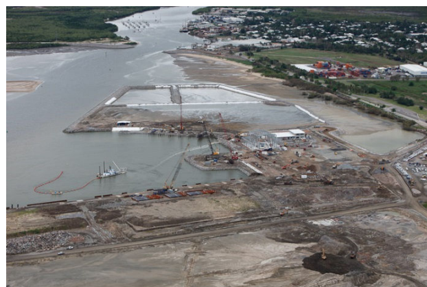
Fig. 3 Small size CSD dredging TMP mooring -2011

Though it has long straight geometry, Ross River channel has a shallow depth of 3 m that not accessible by the large size TSHD 'Brisbane', thus only accessible by small size TSHD. As there is no small size TSHD available in the eastern coast of Australia, the Port of Townsville hires services of small size cutter suction dredge (CSD) on as required basis for Ross River and Townsville Marine Precinct mooring area dredging. The maintenance dredging material derived from Ross River area is pumped into containment ponds at port's eastern reclamation area through submerged, floating and land base pipe line. In addition to the grab dredge, TSHD, and small size CSD vessels, the port regularly uses drag beam 'bed leveller' to agitate silt build-up and drag silt into storage areas as well as removal of high spots that left by the TSHD.