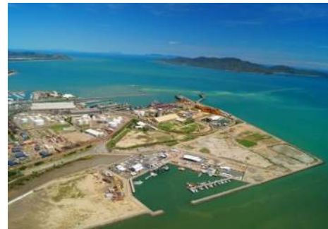
Fig. 5 Port of Townsville Eastern Reclamation Area -2014

Townsville's infrastructure ,Townsville Marine Precinct and the sea channel section of Ross River.