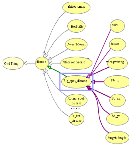
Fig. 2. concept structure of ontology maize disease

Ontology constructed as shown in figure 2 below.