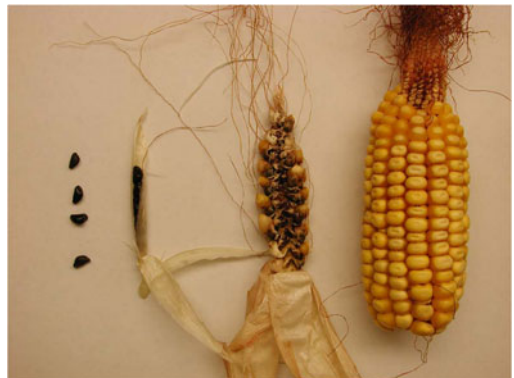
Fig. 1. From left to right, teosinte ( Zea mays ssp. mexicana) fruits, teosinte infructescence, F_1 hybrid infructescence, and maize ( Zea mays ssp. mays) infructescence.