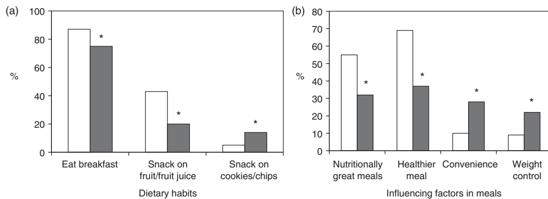
Fig. 1. (a) Dietary habits on breakfast eating and snack choices between nutrition major students (NMs; □) and non-nutrition major students (OMs; ■). (b) Influencing factors in meals between NMs and OMs. * P < 0.05 ( n = 202 ; \chi^2 analysis). Values are percentages.

* NMs recorded higher average exercise time compared with OMs in the category of <120 min/week ( P < 0.05 , n = 202 ; non-paired t tests).