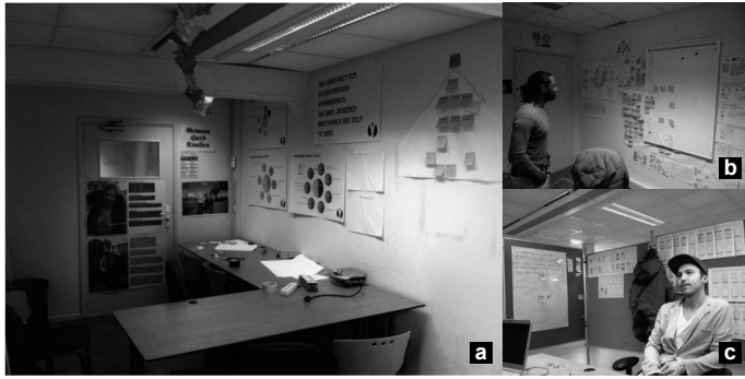
Figure 1. (a) Studio spaces with personas, design visions and summaries of research findings. (b, c) Students immersed themselves in sketches and sticky notes with ideas