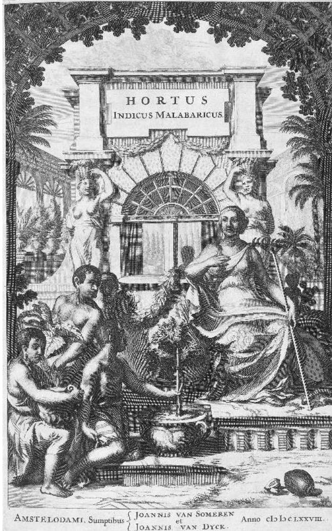
FIGURE 1. Frontispiece of Hortus Malabaricus vol. 1 (1678). Anonymous etching of the Garden of Malabar in which four kneeling indigenous Malayalee children, identified by their elongated earlobes, offer potted plants to the seated figure of Indian Botany.