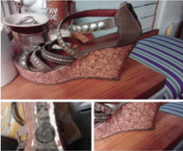
Figure 2. Shoe with hidden magnet for removing security tags.

of the data through designing according to three very different understandings of design research in HCI.