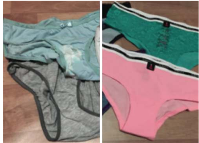
Figure 4. Underwear before (left) and after (right) becoming a member of LiftBlr. This image appeared in a post entitled “the benefits of lifting” where the author claimed that shoplifting improved her self confidence by allowing her to wear new underwear.

There are also memes, poems and references to the mysterious and instinctive nature of shoplifting; the following poem was intended to be sung to the tune of Jingle Bells: