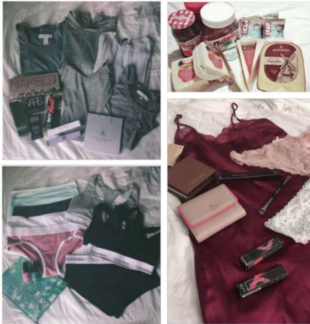
Figure 3. Image of a "haul" of stolen items.

caught or celebrate why it is worth being a LiftBlr. The following is an account that described the pictures in Figure 4 in a post entitled “benefits of lifting”: