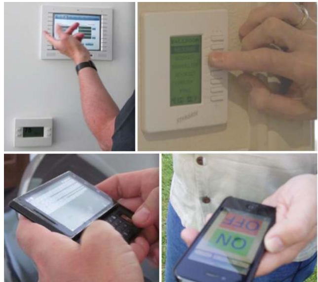
Figure 1. Howard’s and Alan’s professionally-installed home automation system interfaces (top). Irwin’s and Brian’s mobile interfaces for their home-brewed home automation systems (bottom).

Copyright 2012 ACM 978-1-4503-1224-0/12/09...$10.00.