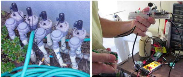
Figure 4. Dave's and Irwin's irrigation actuators and sensors.

holds. Howard installed window shades that could be controlled with wall panel interfaces in each of the rooms of his house. His kitchen sunlight could also open and close via wall panel controls, and closed automatically if the window detected water falling on it. Ed installed automated window shades in their second home, which had very tall, vaulted ceilings and tall windows. While he and his wife were happy with the automated window shades initially, she was frustrated when the batteries died. The batteries were very difficult to reach hidden inside of the top valance of the 20-foot-tall window shades. Irwin installed his own climate control system, which monitored local climates around many parts of the house and also monitored weather predictions from the Internet so that the system could autonomously open vents to the outside. Brian installed controllers for the drapes in their bedroom, a source of some amusement for his wife. She said that “the biggest laugh I’ve had was at about 2 in the morning and the drapes started to automatically open ... I just turned over and said ... ‘Isn’t technology and home automation wonderful?’”