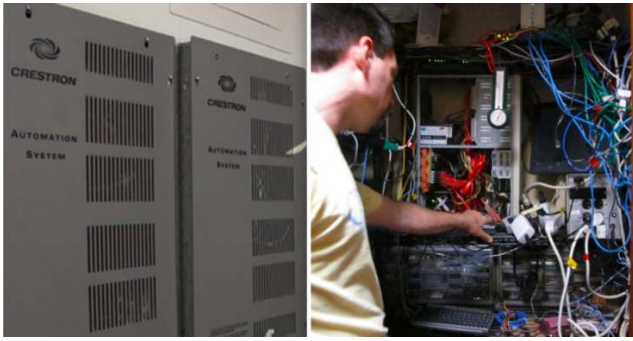
Figure 6. One professionally installed automation system (left) and one home-brewed home automation system computer closet (right).

“insatiable desire to learn new things” was what motivated him to tinker with home automation projects. Although she was one of the most supportive and patient household members amongst our set of informants, she also had drawn the line about where home automation projects were allowed versus forbidden.