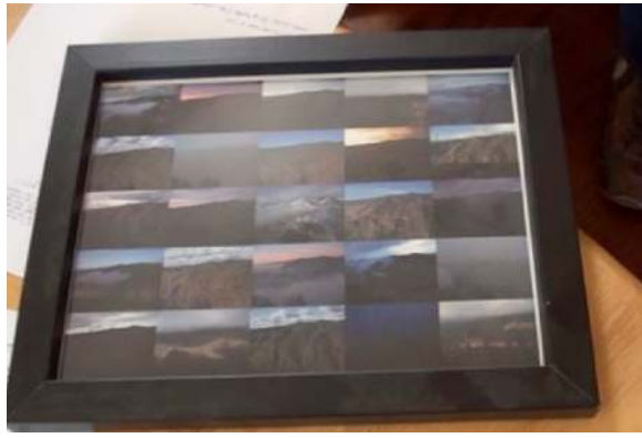
Figure 5. A framed mosaic of CanyonCam photos, a cherished gift.