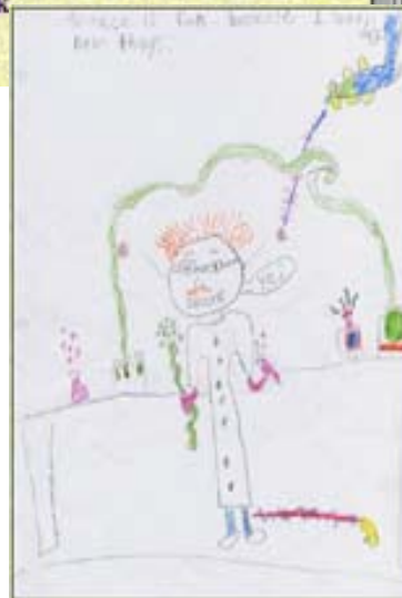
Figure 2. Sample of evidence used to support claims.