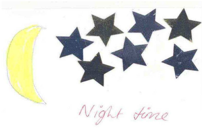
Figure 1: The night sky

The participants' visual data provided an opportunity to observe unseen or forgotten elements of the physical environment such as Tina's representation of the night.