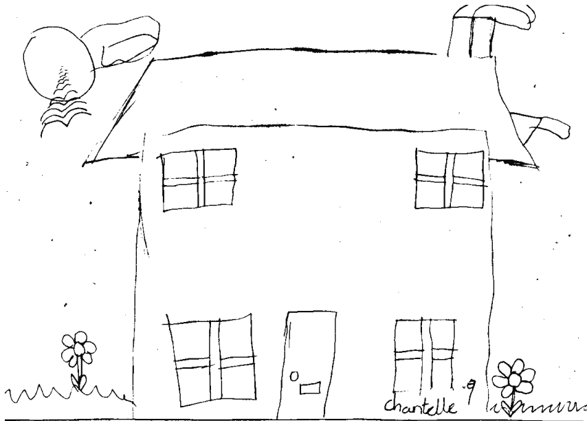
Figure 5: My House