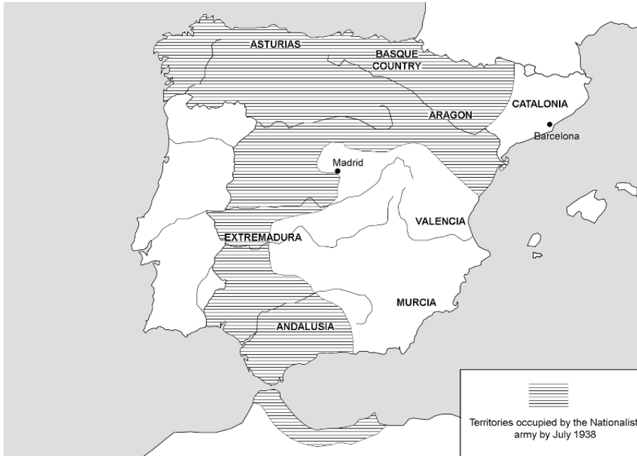
Figure 1. The frontline in 1938 with places mentioned in the article.