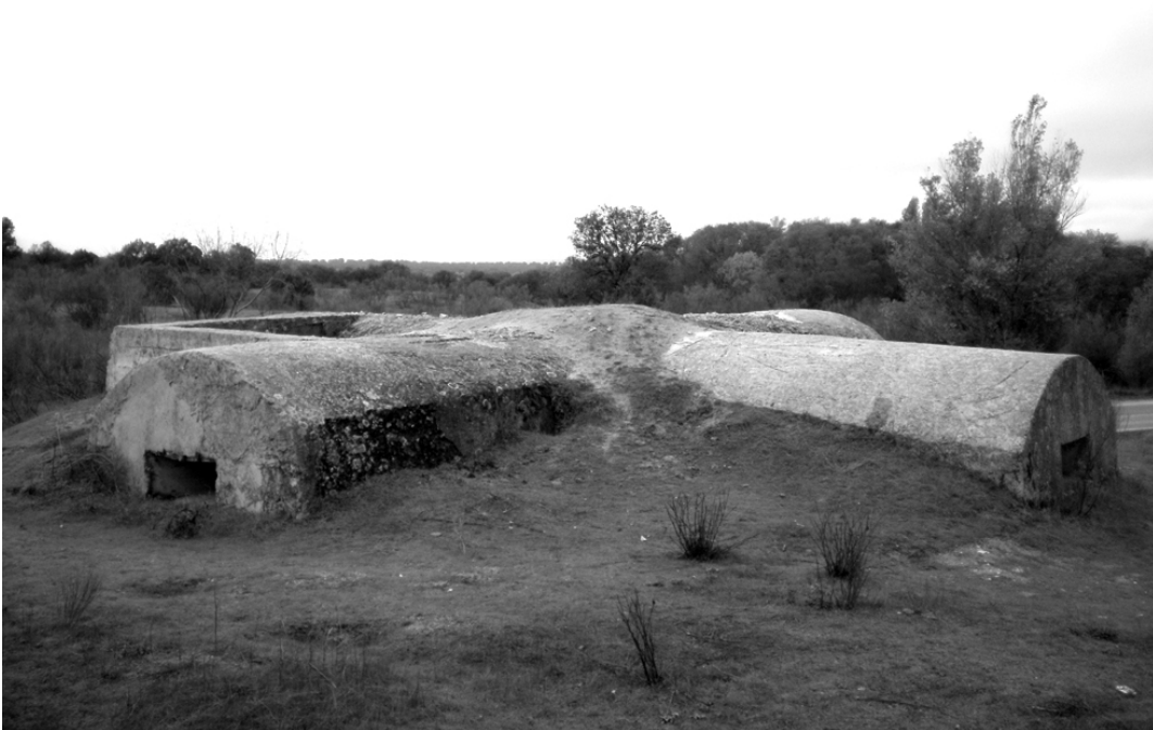
Figure 4. One of the many bunkers from the Civil War surviving in Spain (Brunete, Madrid).