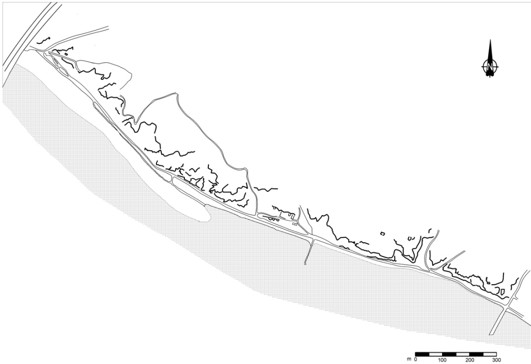
Figure 2. Republican trenches along the Manzanares River (Madrid).