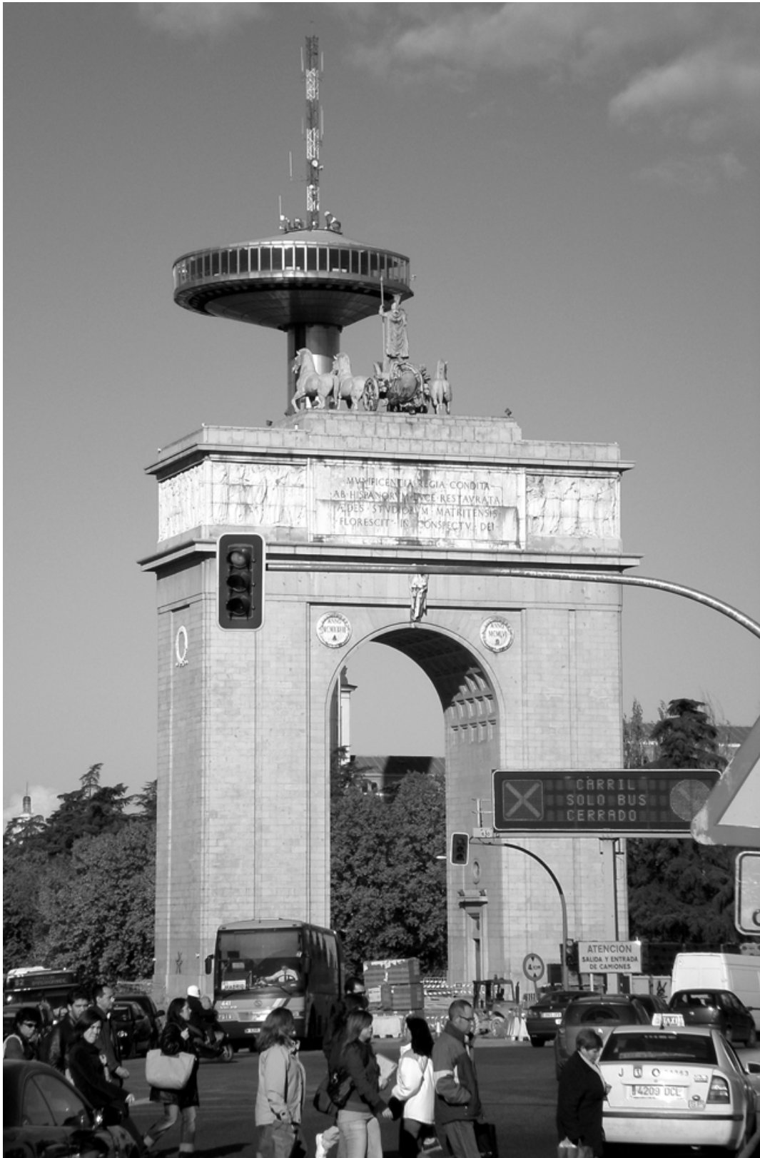
Figure 8. The triumphal arch built by Franco in 1964 for the commemoration of the 25th anniversary of his victory, still presiding over the entrance of Madrid.