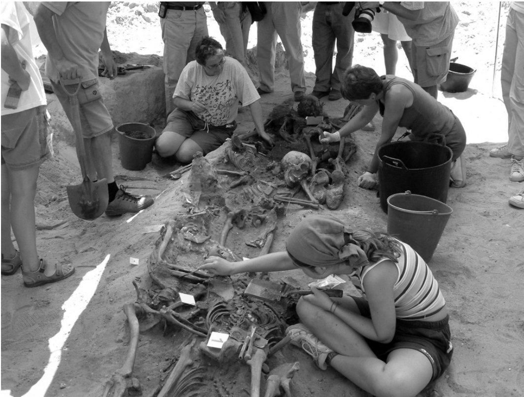
Figure 6. A mass grave excavated by the Asociación por la Recuperación de la Memoria Histórica in Olmedillo de Roa (Burgos).