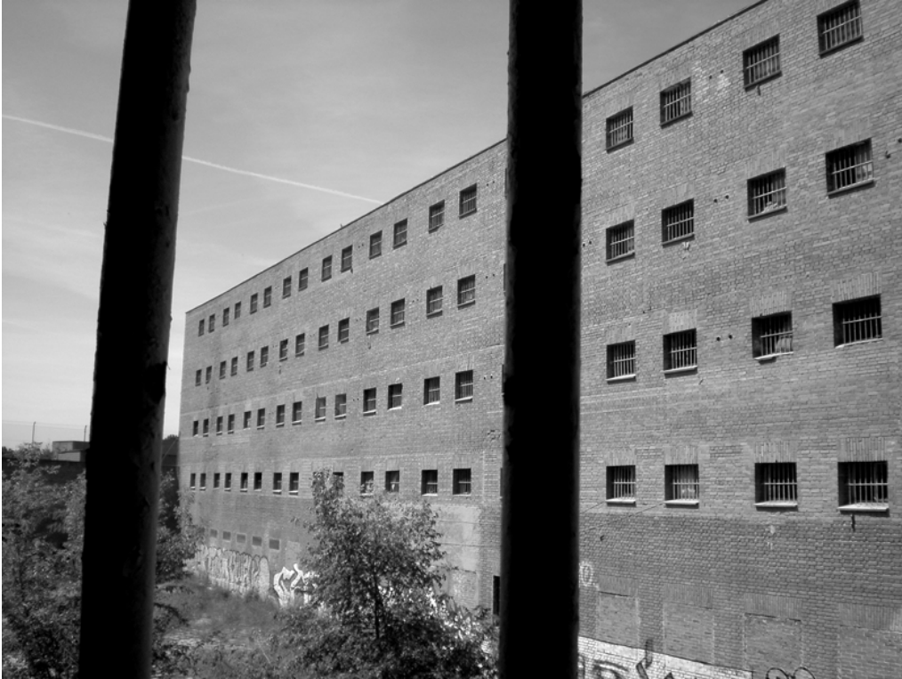
Figure 3. The ruined prison of Carabanchel (Madrid), built in 1940.