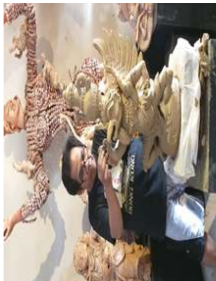
Figure 3: Artwork shape detail creation and improvement.

When the artwork surface is already smooth, the process continued with ornament creation in artwork surface. Artwork ornament creation is done when water level on shape surface is already low (Tri Atmojo, Wahyu dkk., 2014). Ornamentation is done by attach-twist technique and scratching technique. Attach-twist ornament creation is twisting plastic clays to small round shape, twisting, spiral, or scale shape. the twisting result then attached and pressed to surface of planned plate. Those attach-twist shape will create a decorative shape according to clays' characters which are attached and pressed (Tondo, Silverio, Bawer, & Evangelista, 2015).