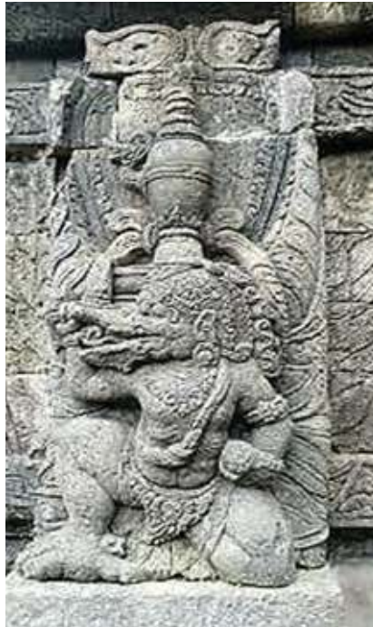
Figure 1: Garuda reliefs as creation idea