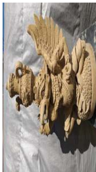
Figure 5: Ceramic artwork sourced from Garudeya Kamandalu relief idea, local artefact of Malang in Kidal temple.