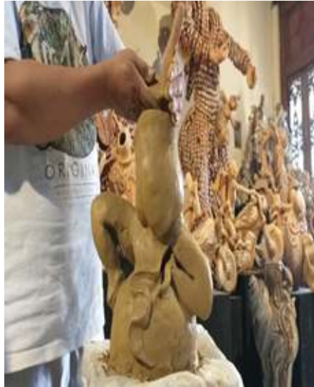
Figure 2: Artwork essential shaping process.