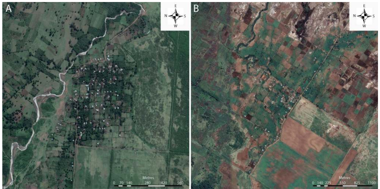
Figure 1. Aerial images of the two study villages, Abulo (A) and Magge (B). The two rural villages are situated within similar agricultural landscapes. Aerial images are taken at different times of the year, which is seen in the difference in crop cover in the two villages. The scale bars indicate distance (m). The aerial images were obtained using the open software Google Earth Pro (Version 7.3.3.7786).

that search outcomes in herbivorous insects are dependent on behavioural patterns within species, which can be broadly categorized into the resource concentration hypothesis 29 or the edge effect 30 . The resource concentration hypothesis postulates that searching individuals are likely to locate and remain in stands with a high host density, and the edge effect favours resources being more extensively used in sparse patches, and importantly more on the edge than in the centre of those patches. The edge is defined as the abrupt transition between habitats differing in quality, affecting the performance of individuals 31 . A patch can be defined as a relatively homogenous nonlinear area that differs from its surroundings 32 and for mosquitoes, we may regard the assembly of blood hosts in a community, either at the household or village level, as a patch, and the homes placed on the outskirts of a community as on the edge of that patch.