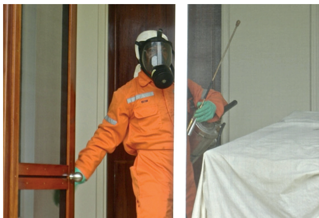
Fig. 2. Spray operators are required to wear protective clothing during indoor residual spraying operations.

before the main transmission season, commonly before the end of December. Follow-up or mop-up spraying, in areas where needed, then continues until March. At district and sub-district level there is integration and collaboration with other health programmes, e.g. Primary Health Care and Health Promotion. Approximately 1.77 million structures are covered with IRS every year in SA (National Department of Health, unpublished data).