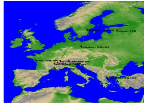
Figure 3: Ground measurement stations in the MESoR benchmarking exercise I

The MESoR project also applied the developed benchmarking. Within MESoR several different benchmarking exercises have been performed. The exercise I which is shown here focuses on DNI for the years 1996 to 2000 in Europe. The stations Nantes, Vaulx-en-Velin and Thessaloniki were excluded in the DNI evaluation as they did not contain a DNI measurement but only global and diffuse.