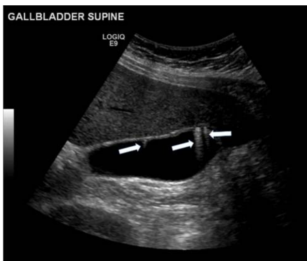
Fig. 2 Pseudopolyps. This selected image from a transabdominal ultrasound scan demonstrates three separate pseudopolyps. Note the reverberation or “comet-tail” artefact posterior to the lesions (arrows)

French et al. concluded that, because the sensitivity and specificity of ultrasound for predicting histology in gallbladder polyps are low, patients with symptoms attributable to the gallbladder should have cholecystectomy, rather than follow-up ultrasound, when a polyp is present [39].