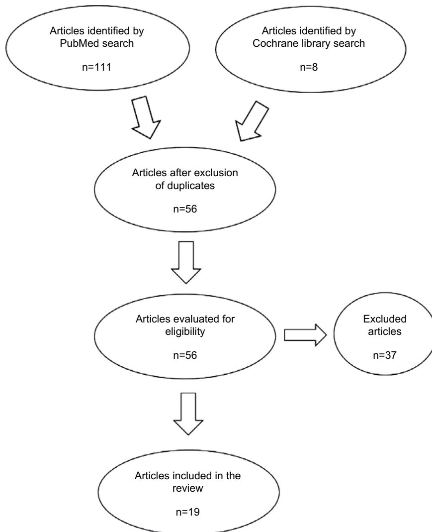
Figure 1 Flow chart for search and selection of articles.

The etiology is not completely clear and is still being debated. Muscle imbalance between the abdominal and hip