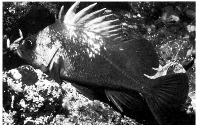
The quillback rockfish ( S. maliger ) is under status review for listing under the Endangered Species Act.