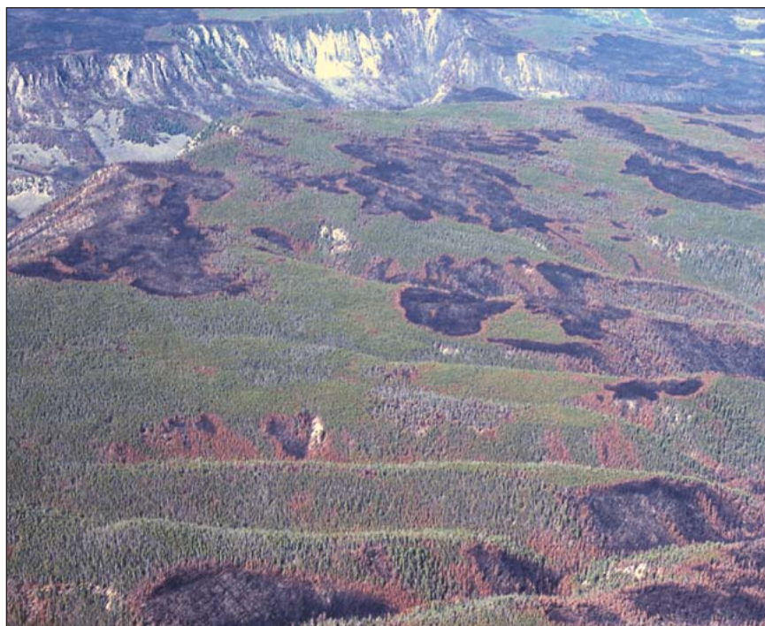
Figure 2. A mosaic fire pattern in Madison Canyon, Yellowstone National Park, approximately one year after the major 1988 fires.

The complexity created by variability in fire regimes defies a simple, one-size-fits-all prescription for restoration. Fortunately, plant association groups, which have predictable relationships to fire regimes (Table 1), provide a classification of this diversity that is useful for man-