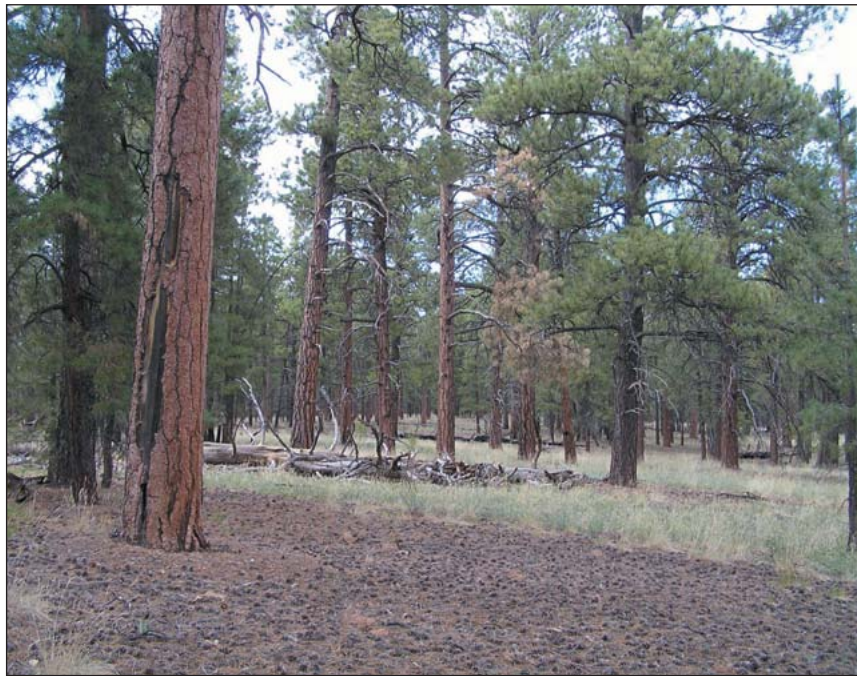
Figure 3. A restored ponderosa pine stand, Grand Canyon National Park (North Rim).

Our key findings on post-fire management are as follows. First, post-burn landscapes have substantial capacity for natural recovery. Re-establishment of forest following stand-replacement fire occurs at widely varying rates; this allows ecologically critical, early-successional habitat to persist for various periods of time. Second, post-fire (salvage) logging does not contribute to ecological recovery; rather, it negatively affects recovery processes, with the intensity of impacts depending upon the nature of the logging activity (Lindenmayer et al. 2004). Post-fire logging in naturally disturbed forest landscapes generally has no direct ecological benefits and many potential negative impacts (Beschta et al. 2004; Donato et al. 2006; Lindenmayer and Noss 2006). Trees that survive fire for even a short time are critical as seed sources and as habitat that sustains biodiversity both above- and belowground. Dead wood,